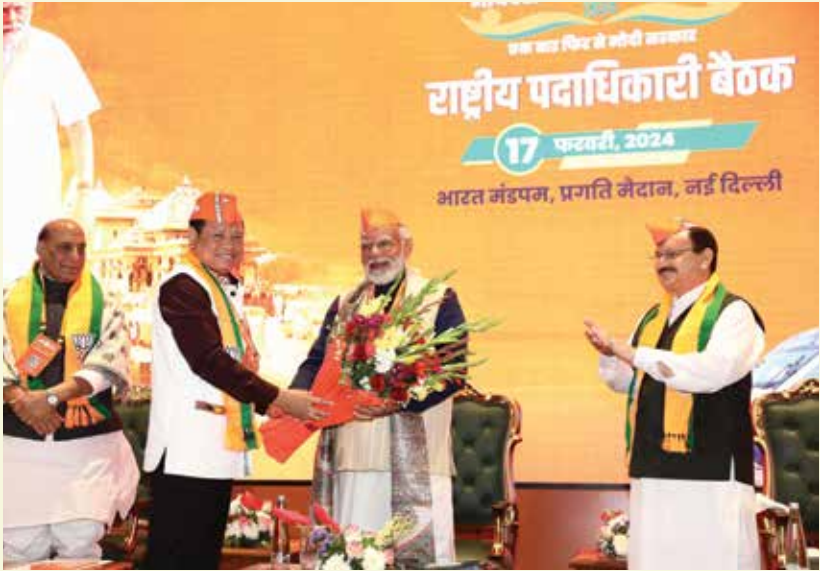
PM Shri Narendra Modi being welcomed in the presence of BJP National President Shri JP Nadda and Defence Minister Shri Rajnath Singh to BJP National Office Bearers Meeting at Bharat Mandapam, New Delhi on 17 February, 2024