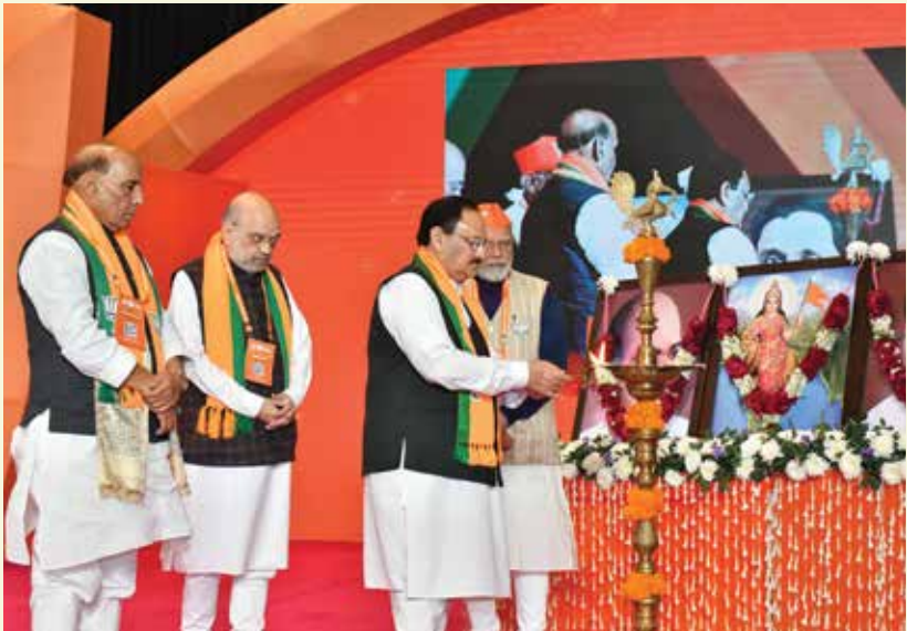
BJP National President Shri JP Nadda along with PM Shri Narendra Modi, Union Ministers Shri Rajnath Singh and Shri Amit Shah lighting the lamp at the commencement of BJP National Convention in New Delhi on 17 February, 2024