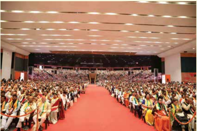
A grand view of the BJP National Convention held at Bharat Mandapam, New Delhi on 17-18 February, 2024