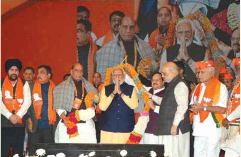
PM Shri Narendra Modi being felicitated in the BJP National Convention at Bharat Mandapam, New Delhi on 18 February, 2024