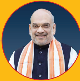
Shri Amit Shah, Union Home & Cooperation Minister

In the aftermath of the 1980s, a wave of terrorism swept through the region, resulting in the complete displacement of individuals who had called it home for generations. Sadly, their plight went largely unnoticed, and these displaced citizens found themselves living as refugees in other corners of their own country. As per current statistics, a staggering 1,57,967 people from approximately 46,631 families have been displaced within their own nation. This Bill is not merely a legislative document; it is a crucial initiative aimed at restoring rights and representation to these displaced individuals.