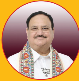
Shri Jagat Prakash Nadda, National President, BJP

The Bharatiya Janata Party welcomes the decision made by the Honourable Supreme Court pertaining to Article 370. The Constitutional Bench of the Supreme Court has rightly upheld the decision, process, and intent behind the removal of Articles 370 and 35A. The government, under the leadership of Honourable Prime Minister Shri Narendra Modi, has accomplished the historic task of integrating Jammu and Kashmir into the mainstream of the country. For this, I, along with our millions of party workers, express heartfelt gratitude to Prime Minister Narendra Modi ji.