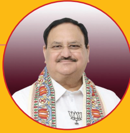
Shri Jagat Prakash Nadda, National President, BJP

Prime Minister Shri Narendra Modi ji, while replying to the motion of thanks to the address of the Hon'ble President in the Lok Sabha, expressed the commitment of our government towards the 'Viksit Bharat Nirnam'.