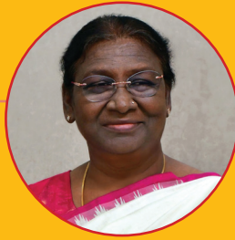
Smt. Droupadi Murmu, President of India