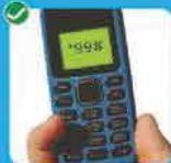
USSD Any to any transaction using 4 digit number