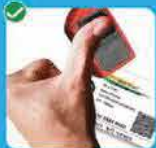
Aadhaar Enabled Payment System