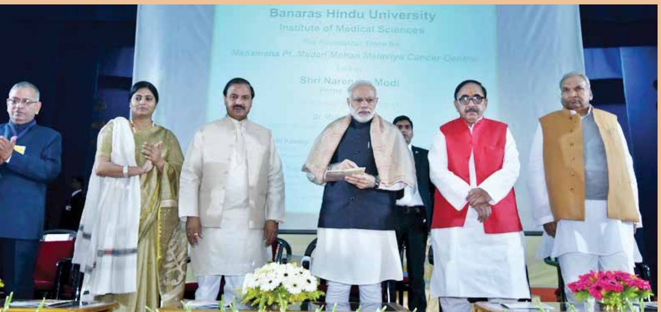
PM Shri Narendra Modi flanked by Union Ministers Dr. Mahesh Sharma, Smt. Anupriya Patel, Shri Mahendra Pandey and others laying the Foundation Stone for a Super Speciality Cancer Hospitals in Varanasi, UP.