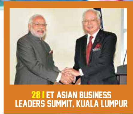
28 | ET ASIAN BUSINESS LEADERS SUMMIT, KUALA LUMPUR

Vol. 12, No. 01, 01-15 January, 2017 (Fortnightly)