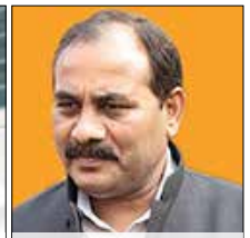
Dara Singh Chauhan

Shri Ramvichar Netam, a Rajya Sabha member from Chhattisgarh has been appointed as the National President of BJP S.T Morcha.