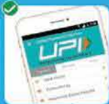
UPI Do payments through UPI App of your bank