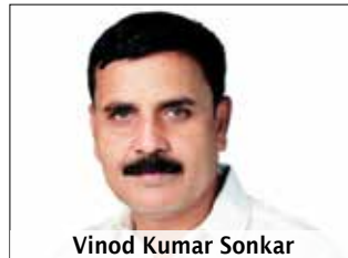
Vinod Kumar Sonkar

Shri Vinod Kumar Sonkar, a Lok Sabha member from Kaushambi, Uttar Pradesh has been appointed as the National President of BJP S.C Morcha.