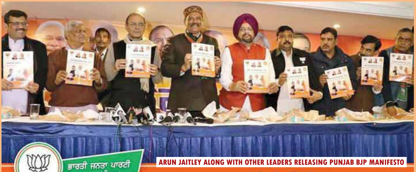
ARUN JAITLEY ALONG WITH OTHER LEADERS RELEASING PUNJAB BJP MANIFESTO