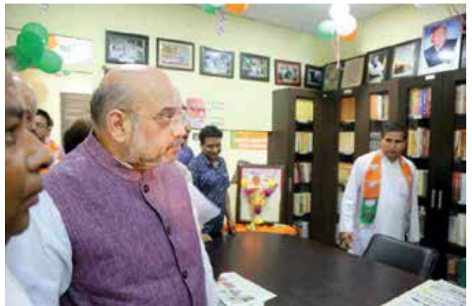
BJP National President Shri Amit Shah inaugurating Nanaji Deshmukh Library and E-Library at State BJP Office, Jammu.