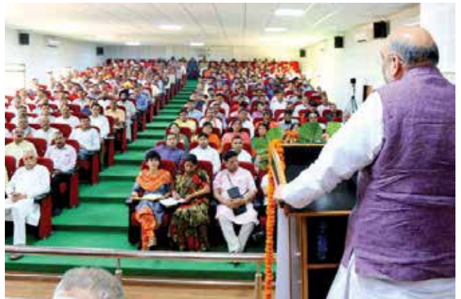
BJP National President Shri Amit Shah addressing a meeting on Pt. Deen Dayal Upadhyay Birth centenary year and Karya Vistar Yojana at State BJP Office, Jammu.