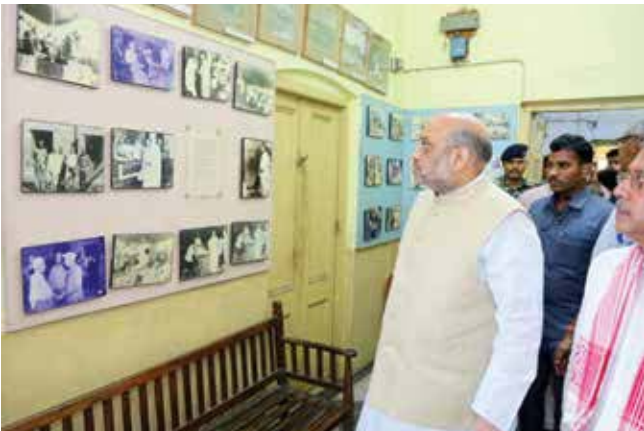
BJP National President Shri Amit Shah visits the ancestral house of Jan Sangh founder Dr. Shyama Prasad Mookerjee in Kolkata.