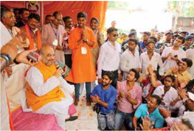
BJP National President Shri Amit Shah interacting with booth level karyakartas at booth no 269 Bhowanipore, Kolkata.