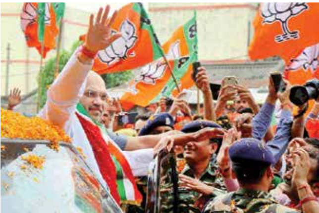
Grand reception of BJP National President Shri Amit Shah on his arrival at Jammu Airport in J&K.