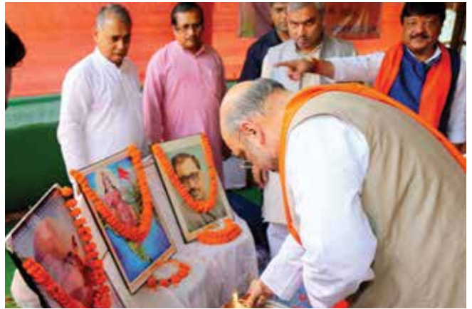
Shri Amit Shah launches Pt. Deendayal Upadhyay Vistarak Yojana in West Bengal.