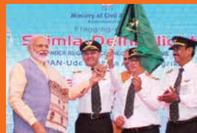
PM LAUNCHES UDAN – UDE DESH KA AAM NAAGRIK- FROM SHIMLA