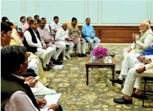
PM Shri Narendra Modi interacting with MPs from Gujarat