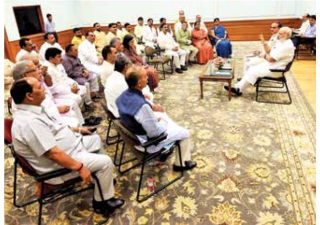
PM Shri Narendra Modi interacting with MPs from Western UP