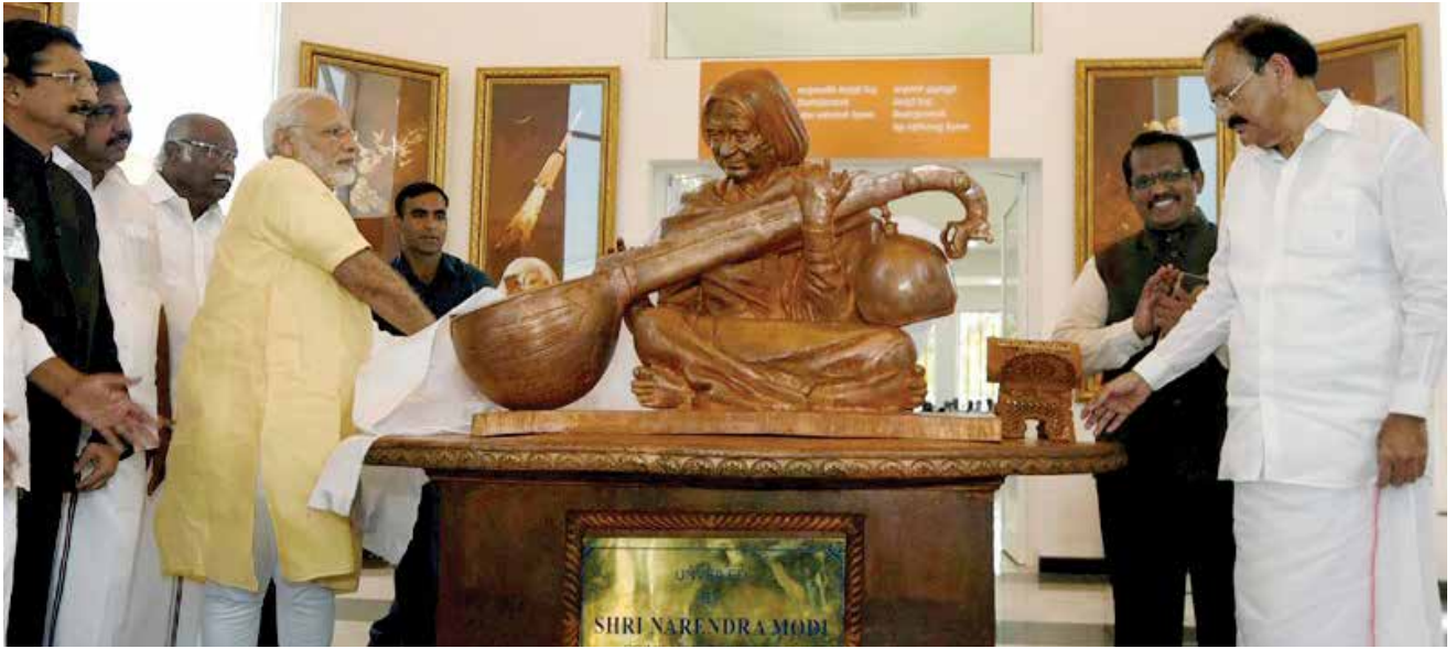
PM Shri Narendra Modi flanked by Union Minister Shri M. Venkaiah Naidu unveiling the memorial of former President of India Dr. A.P.J. Abdul Kalam at Rameswaram, Tamil Nadu