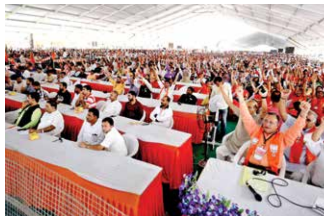
Gujarat CM Shri Vijay Rupani and other senior BJP leaders welcoming BJP National President Shri Amit Shah to the Panna Pramukh Sammellan at Anawal Panchkakda, Gujarat