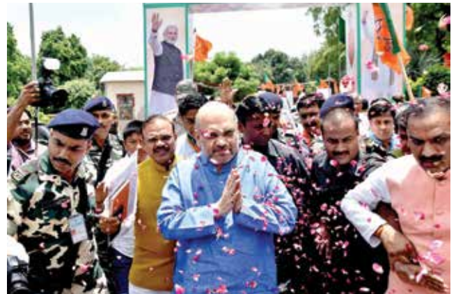
Delhi BJP President Shri Manoj Tiwari, Union Minister Dr. Harshvardhan and other senior leaders welcoming BJP National President Shri Amit Shah on his Vistrit Pravas in Delhi