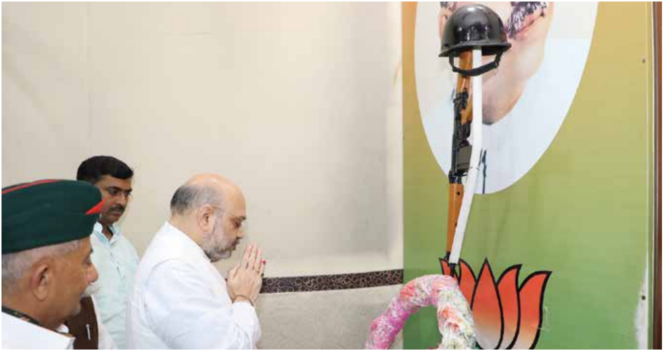
BJP National President Shri Amit Shah paying floral tribute to the martyrs of Kargil War on Kargil Vijay Diwas