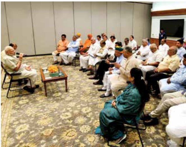
PM Shri Narendra Modi interacting with MPs from Rajasthan