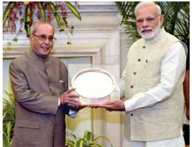
PM Shri Narendra Modi presents a memento to the former President Shri Pranab Mukherjee on the occasion of farewell hosted by him for the former President at Hyderabad House in New Delhi