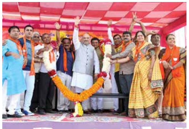
BJP National President Shri Amit Shah & other leaders waving at the gathering in Mangrol (Junagadh)