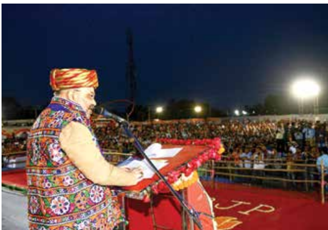
BJP National President Shri Amit Shah addressing a public meeting in Kutch