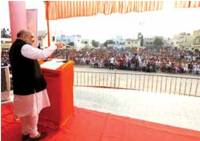
BJP National President Shri Amit Shah addressing a huge public meeting in Devbhoomi Dwarka