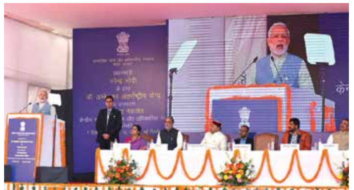
PM Shri Narendra Modi dedicating Dr. Ambedkar International Centre, New Delhi to the nation