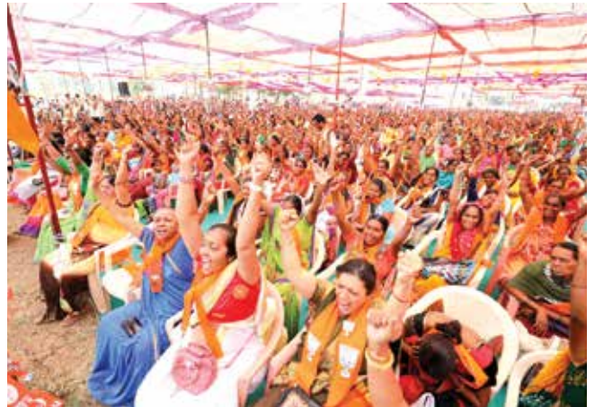
View of cheering women gathering in Tapi meeting