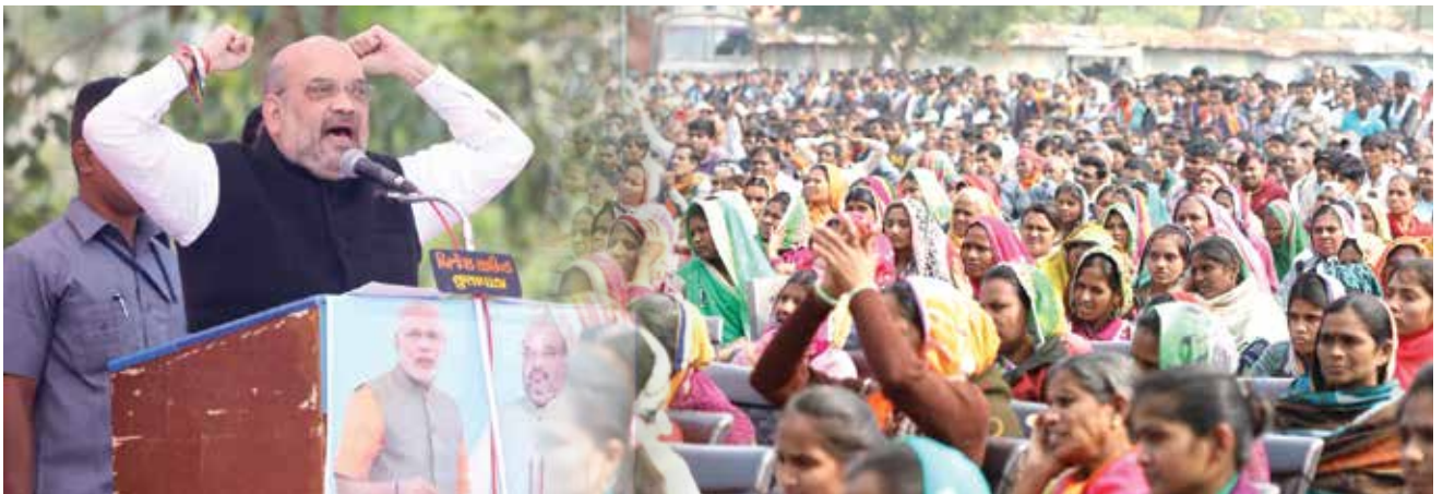
BJP National President Shri Amit Shah addressing a public meeting in Kadana (Mahisagar)