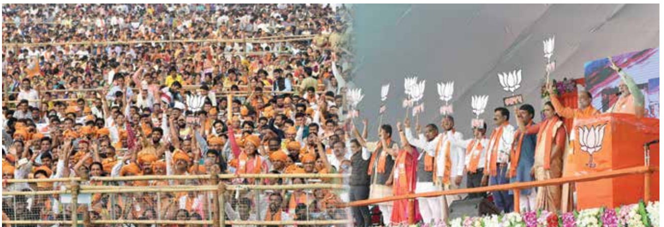
PM Shri Narendra Modi addressing a massive gathering at an election rally in Surat, Gujarat