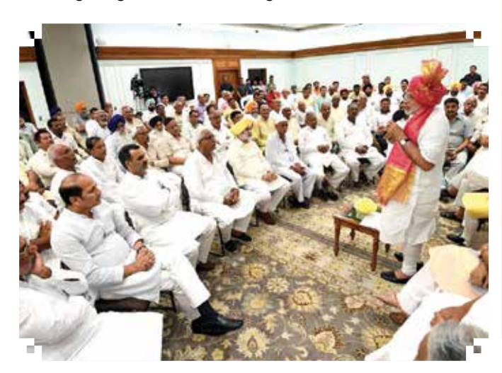
Prime Minister Shri Narendra Modi interacting with a group of sugarcane farmers at his residence in New Delhi