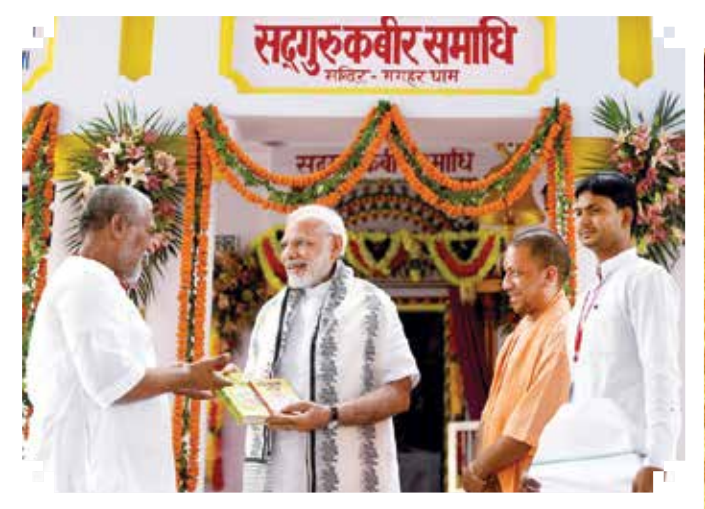
Prime Minister Shri Narendra Modi along with UP CM Yogi Adityanath at the Samadhi of great saint and poet Kabir at his village Maghar in Sant Kabir Nagar district of Uttar Pradesh