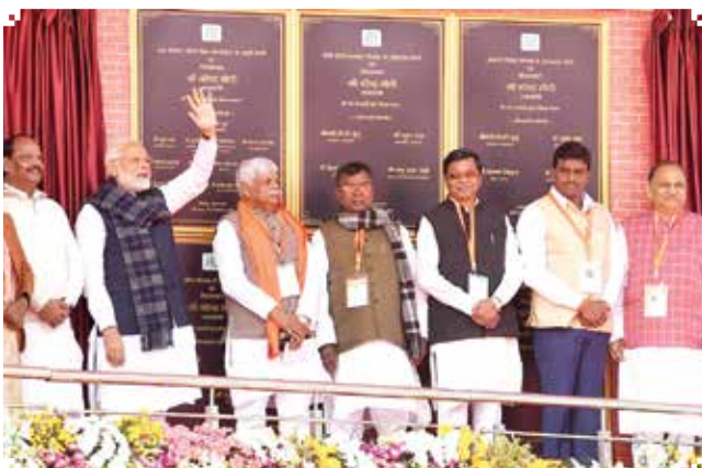
PM Shri Narendra Modi along with other leaders of Jharkhand inaugurates and lays foundation stone of several development projects in Palamu, Jharkhand