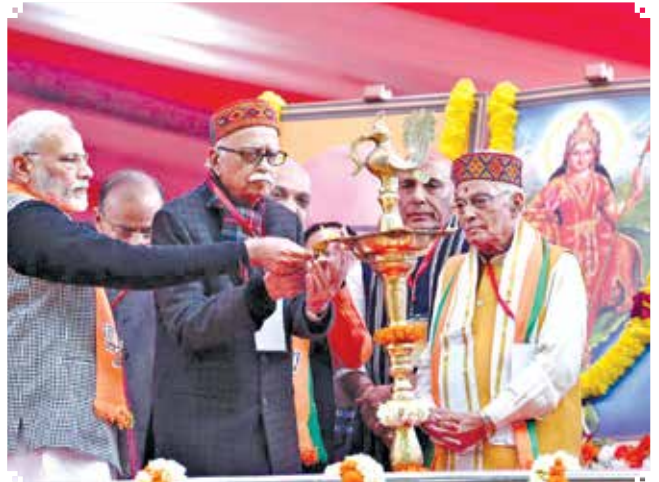
PM Shri Narendra Modi along with BJP National President Shri Amit Shah, Senior leaders Shri L.K. Advani and Dr. Murlu Manohar Joshi and Union Minister Shri Rajnath Singh lighting the lamp to inaugurate the BJP National Convention in New Delhi