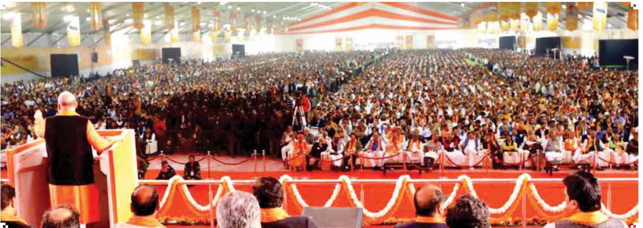
BJP National President Shri Amit Shah addressing the huge gathering of BJP karyakartas at the inaugural session of party National Convention