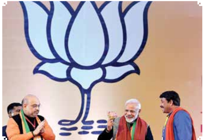
Delhi BJP President Shri Manoj Tiwari welcoming PM Shri Narendra Modi and BJP National President Shri Amit Shah to the convention