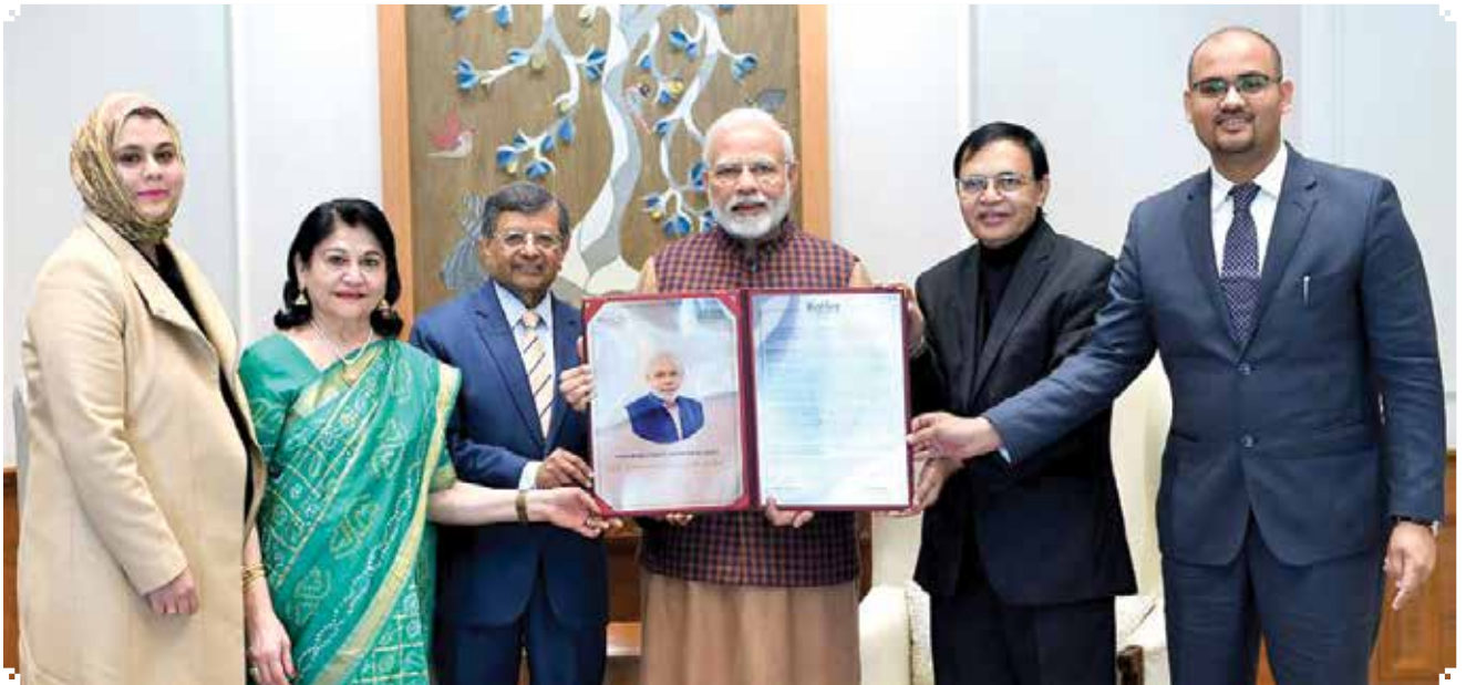
Prime Minister Shri Narendra Modi receiving the first-ever 'PHILIP KOTLER PRESIDENTIAL' award in New Delhi from the Professors of EMORY University, Georgia, USA