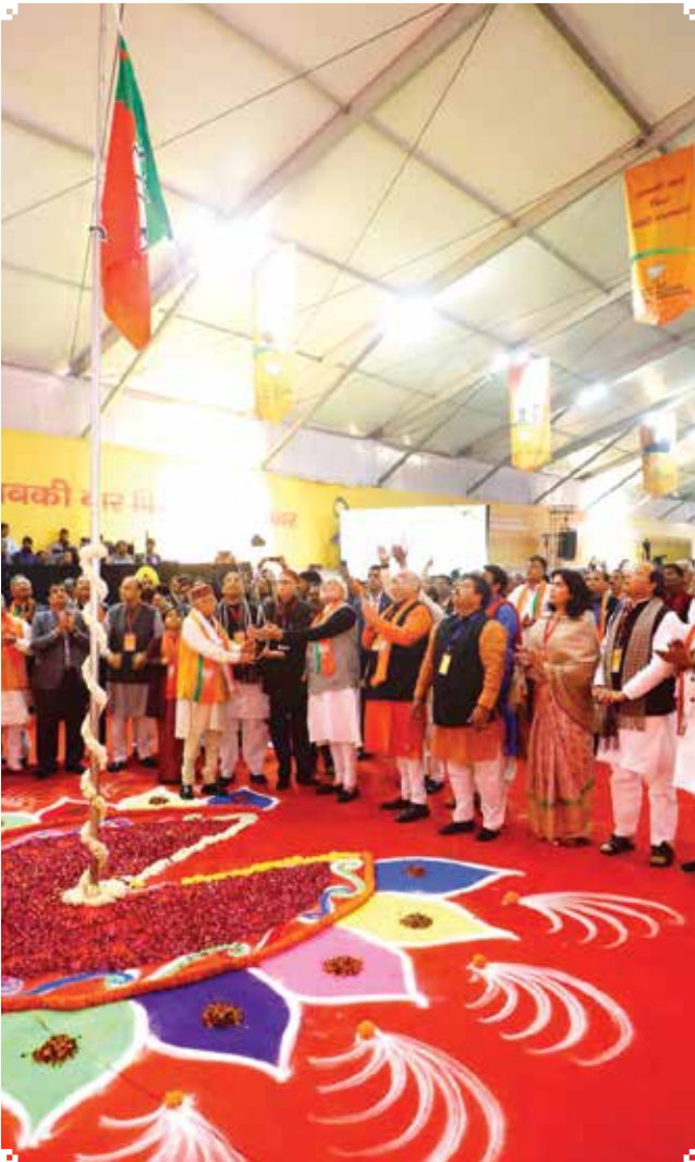
PM Shri Narendra Modi flanked by BJP National President Shri Amit Shah and other senior leaders of the party hoisting the BJP flag before the commencement of BJP National Convention