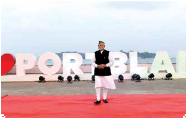
Prime Minister Shri Narendra Modi at the Marina Park at Port Blair in Andaman and Nicobar Islands