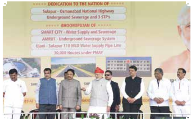
PM Shri Narendra Modi flanked by Union Minister Shri Nitin Gadkari and other leaders dedicates multiple development projects in Solapur, Maharashtra