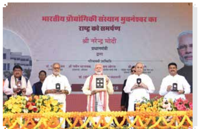
PM Shri Narendra Modi flanked by Odisha CM and other BJP leaders inaugurating the IIT Bhubaneswar campus and releasing a coin on the Paika Rebellion in Bhubaneswar, Odisha