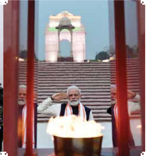
PM Shri Narendra Modi dedicating the National War Memorial to the Nation in New Delhi