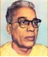
BALA SAHEB DEORAS

D EENDAYAL Upadhyaya came from a poor family and was brought up by his maternal uncle. In school days he was known as a brilliant student and stood first in almost every examination. But even during his brilliant career he was also known for his social outlook.