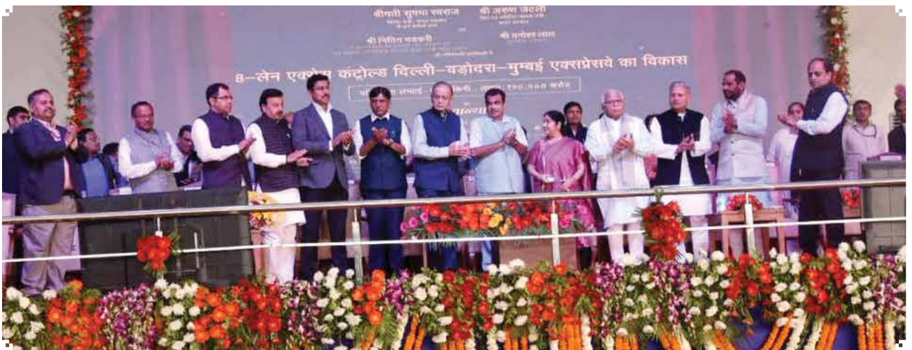
Union Finance Minister Shri Arun Jaitley, Foreign Affairs Minister Smt. Sushma Swaraj, Minister of Transport and Highways Shri Nitin Gadkari and others laying the foundation stone of the Delhi-Mumbai Expressway and Dwarka Expressway in Delhi