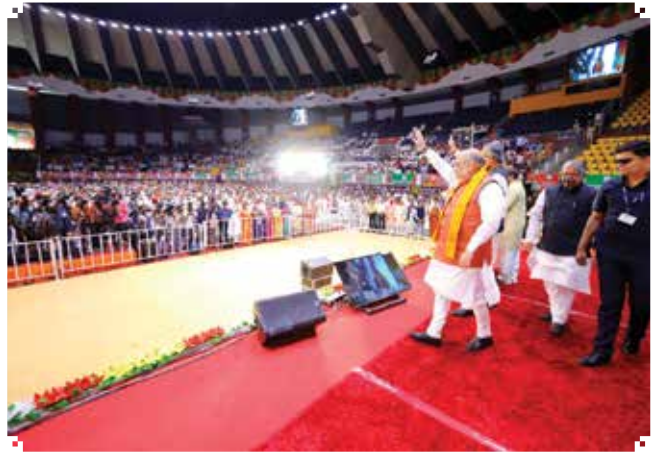
BJP National President Shri Amit Shah waving at the gathering in Raipur, Chhattisgarh