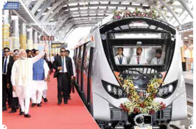
PM Shri Narendra Modi inaugurating Phase-1 and laid the foundation stone for Phase-2 of Ahmedabad Metro