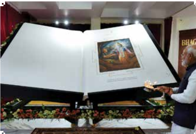
PM Shri Narendra Modi unveiling a Bhagwad Gita that is 2.8 meters high and weighs over 800 kg in ISKCON, New Delhi