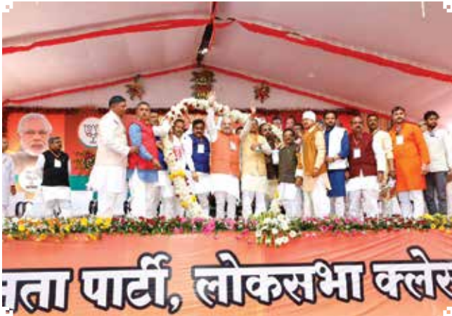
Madhya Pradesh BJP welcomes BJP National President Shri Amit Shah to a huge Booth Karyakarta Sammelan at Sagar