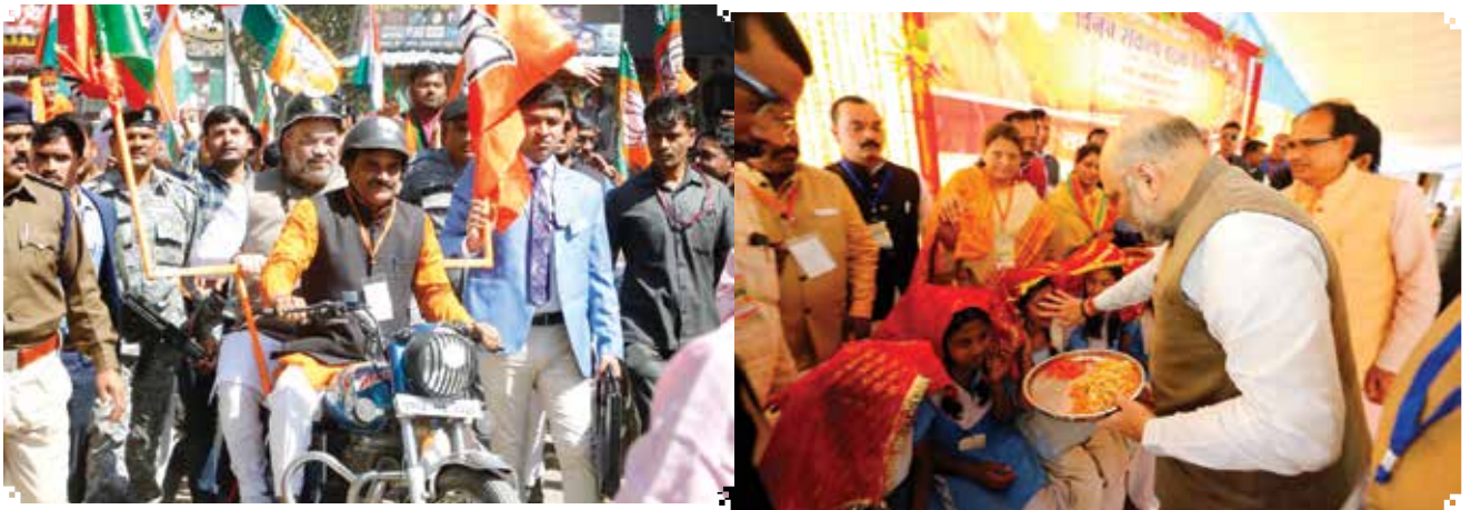
BJP National President Shri Amit Shah flanked by BJP National Vice President Shri Shivraj Singh Chauhan and others launching the Vijay Sankalp Bike Rally from Umariya, Madhya Pradesh