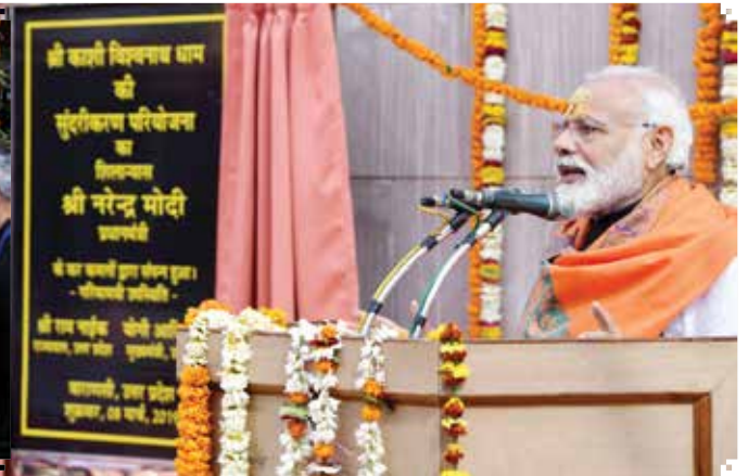
PM Shri Narendra Modi along with UP Governor Shri Ram Naik, UP CM Shri Yogi Adityanath and UP BJP President Shri Mahendra Nath Pandey and others laying the foundation for the Kasi Vishwanath Corridor in Varanasi, UP