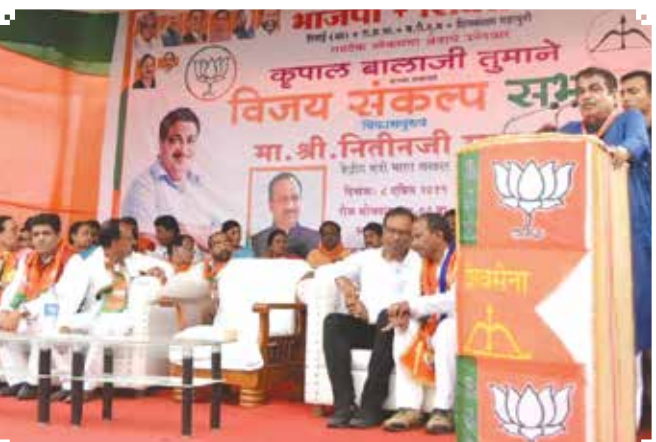
Union Minister Shri Nitin Gadkari addressing a 'Vijay Sankalp Rally' in Ramtek, Maharashtra