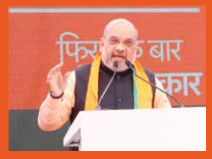
CONGRESS MANIFESTO A PACK OF LIES