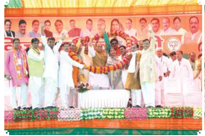
UP BJP welcomes Union Minister Shri Rajnath Singh at a 'Vijay Sankalp Sabha' in Gautam Buddh Nagar