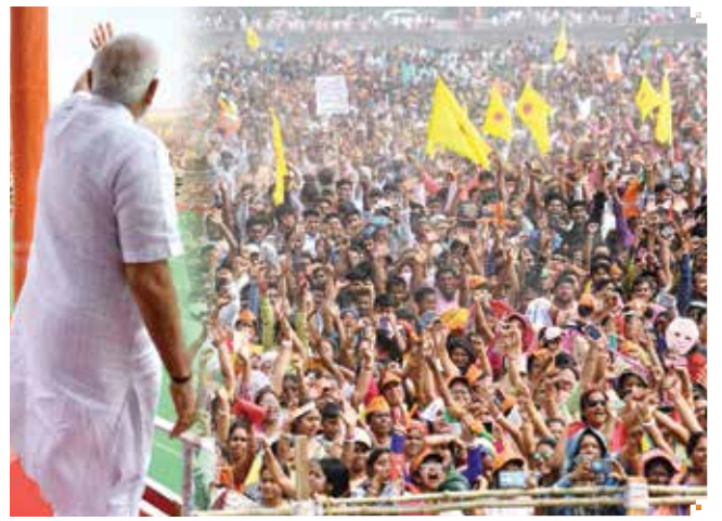
PM Shri Narendra Modi at an election rally in Siliguri, West Bengal