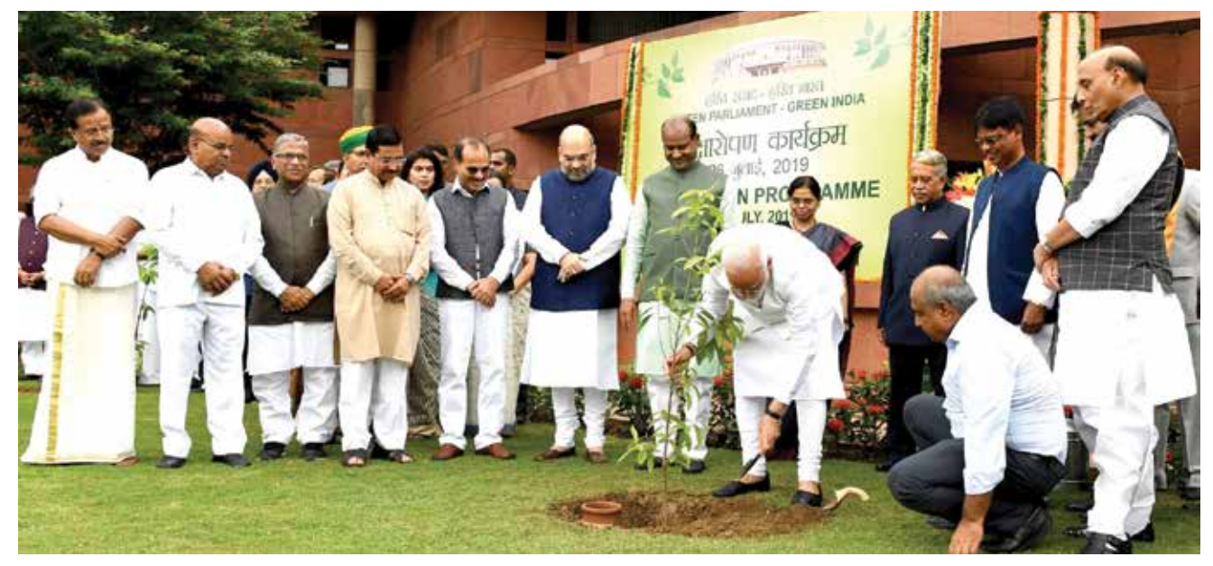
Prime Minister Shri Narendra Modi planting the sapling with other dignitaries at the tree plantation drive organised by the Lok Sabha Secretariat at Parliament House Premises in New Delhi