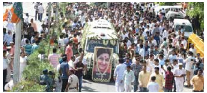
Huge crowed at Smt. Sushma Swaraj's last journery in New Delhi