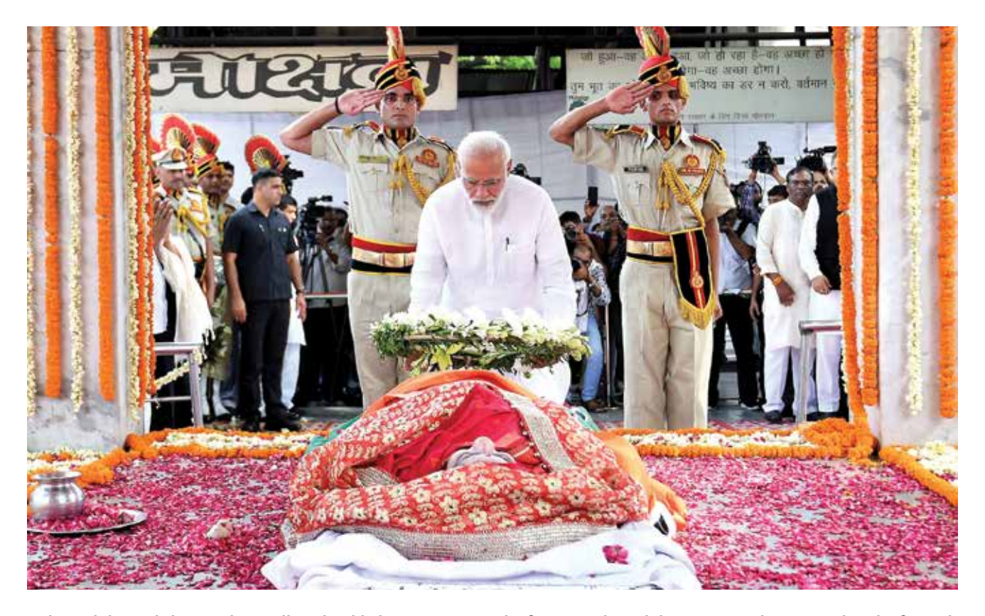
Prime Minister Shri Narendra Modi paying his last respects to the former Union Minister Smt. Sushma Swaraj at the funeral ceremony in New Delhi