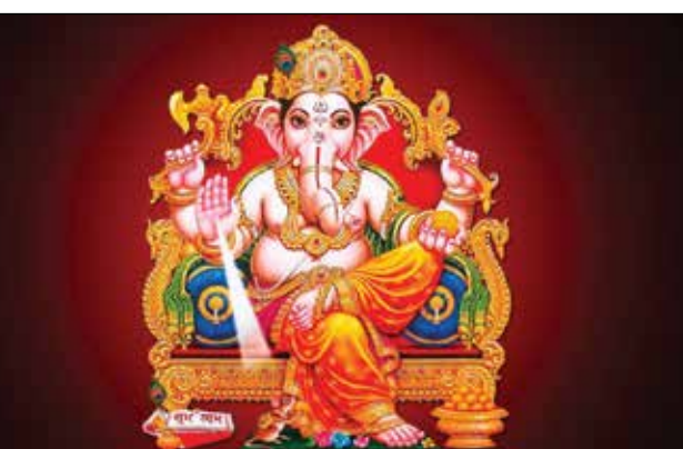
KAMAL SANDESH PARIVAR wishes a very happy GANESH CHATURTHI (2 SEPTEMBER) to all of its readers