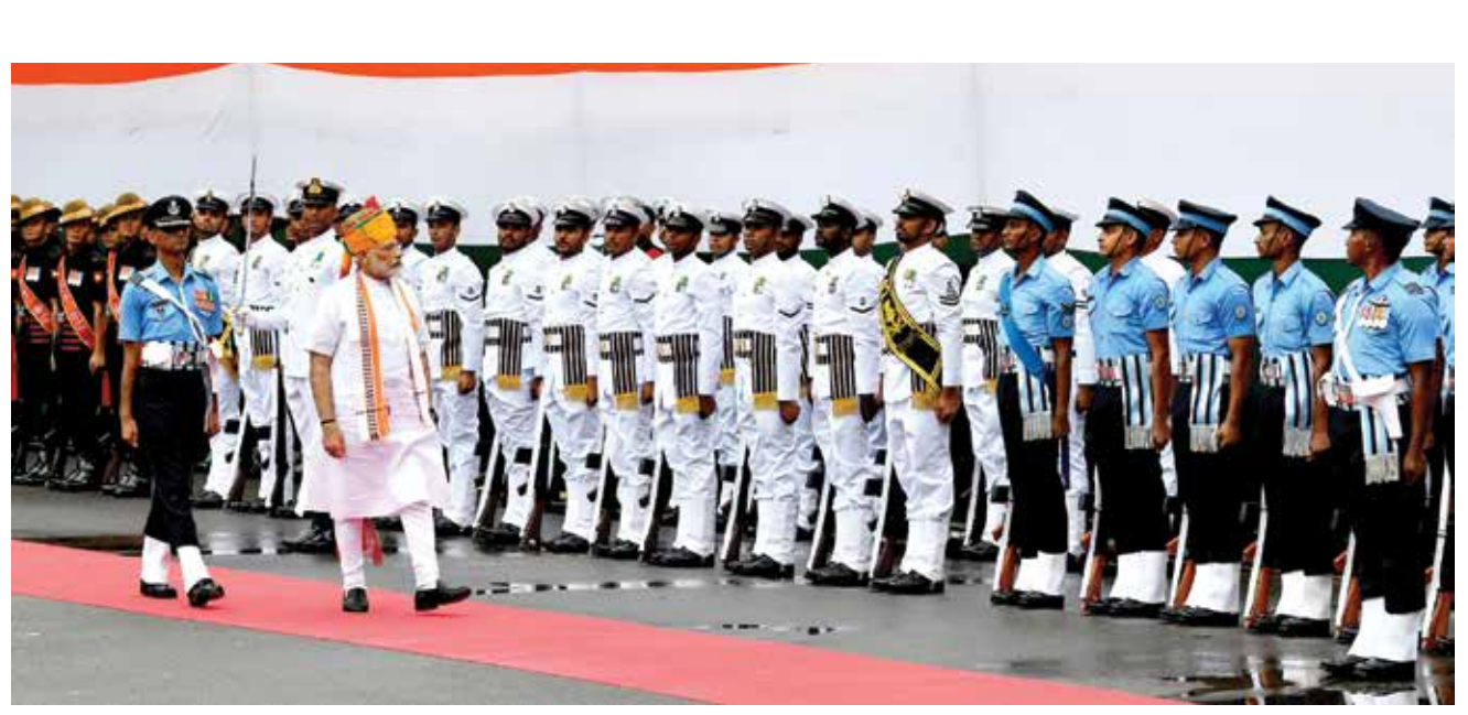
PM Shri Narendra Modi inspecting the Guard of Honour at Red Fort on the occasion of 73rd Independence Day in Delhi