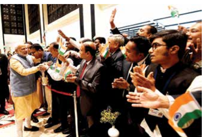
The people of Bhutan welcoming PM Shri Narendra Modi after his arrival in Bhutan