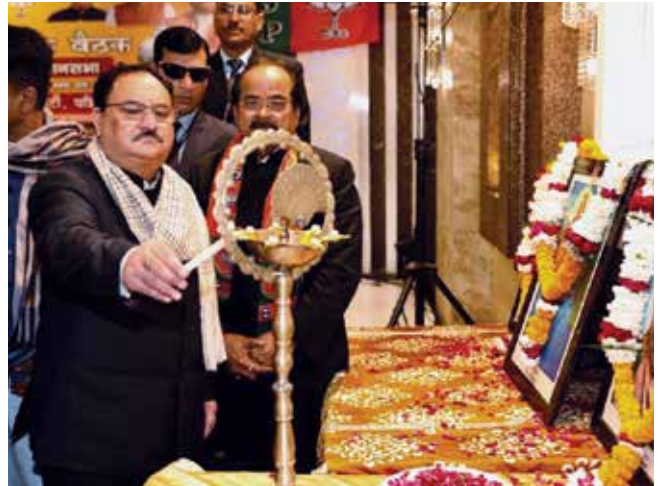
BJP National President Shri JP Nadda lighting the lamp before an organisational meeting at Tilak Nagar, New Delhi