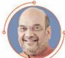
Amit Shah 2014 to 2020