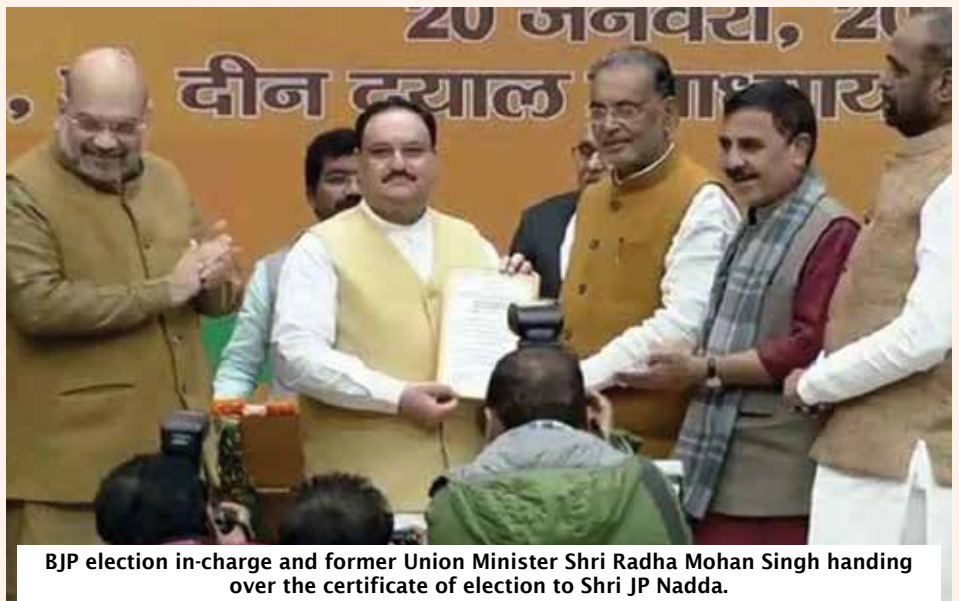
BJP election in-charge and former Union Minister Shri Radha Mohan Singh handing over the certificate of election to Shri JP Nadda.

Shri Nadda also held the position of Member Secretary of the BJP Parliamentary Board, the highest decision making body of the party. He had also served as a Union Minister in the first Modi government.