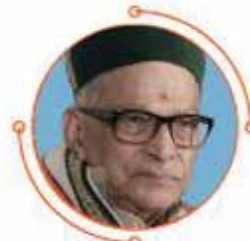
Murli Manohar Joshi 1991 to 1993