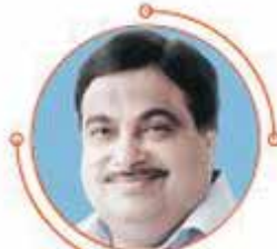
Nitin Gadkari 2010 to 2013