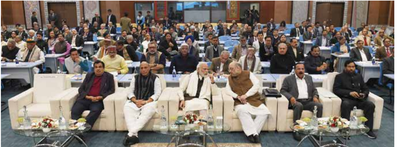
PM Shri Narendra Modi along with Union Ministers Shri Amit Shah, Shri Rajnath Singh, Shri Nitin Gadkari and others meeting with Council of Ministers, New Delhi