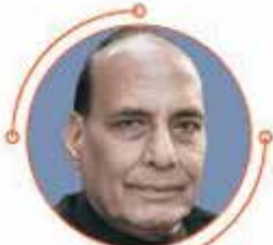
Rajnath Singh 2005 to 2009 and 2013 to 2014