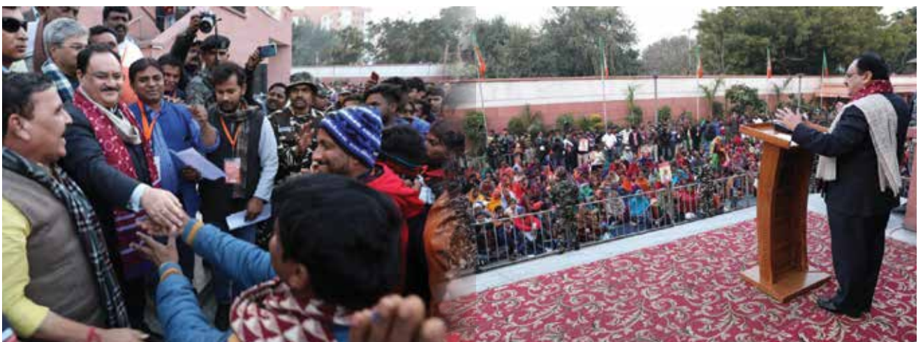
BJP National President Shri JP Nadda meeting and addressing the Dalit refugees from Pakistan who visited BJP National Headquarters thanking the Modi government for enacting the CAA