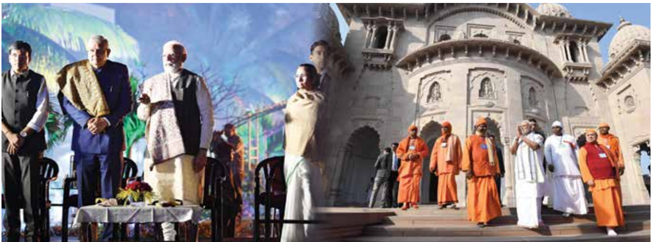
PM Shri Narendra Modi launching the Interactive Light and Sound Show of Rabindra Setu and visiting Belur Math in Kolkata. Governor of West Bengal Shri Jagdeep Dhankhar, CM Ms. Mamata Banerjee and Union Minister of State Shri Mansukh L. Mandaviya are also seen in the picture.