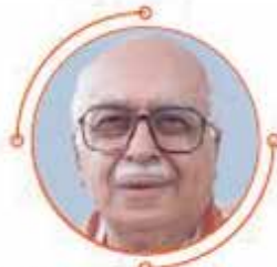
Lal Krishna Advani 1986 to 1990, 1993 to 1998 and 2004 to 2005