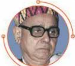
Kushabhau Thakre 1998 to 2000