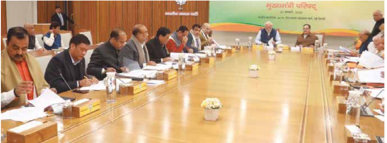
PM Shri Narendra Modi flanked by BJP National President Shri JP Nadda, Union Ministers Shri Amit Shah, Shri Rajnath Singh and others presiding a meeting of Chief Ministers Council at BJP Headquarters, New Delhi