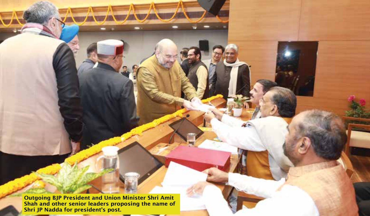
Outgoing BJP President and Union Minister Shri Amit Shah and other senior leaders proposing the name of Shri JP Nadda for president's post.

Mahagatbandhan successfully and delivered the results with flying colors where, BJP along with its allies won 64 out of the 80 Lok Sabha seats.