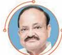
M. Venkaiah Naidu 2002 to 2004