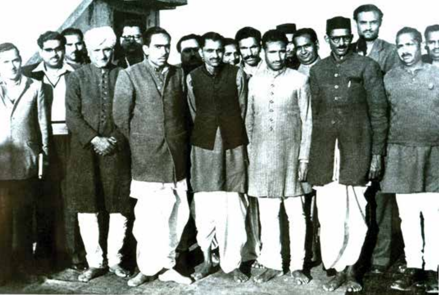
Pt. Deendayal Upadhyaya, with the leaders of Jana Sangha

A year on, I am meeting with top business leaders and investors in the United States, building on the ground we had covered last year. Wherever I am travelling, I have seen renewed enthusiasm towards investing in India. We, on our part are doing everything possible to further this spirit. We have made doing business easier, are working to make our tax structures more predictable, stable and competitive.