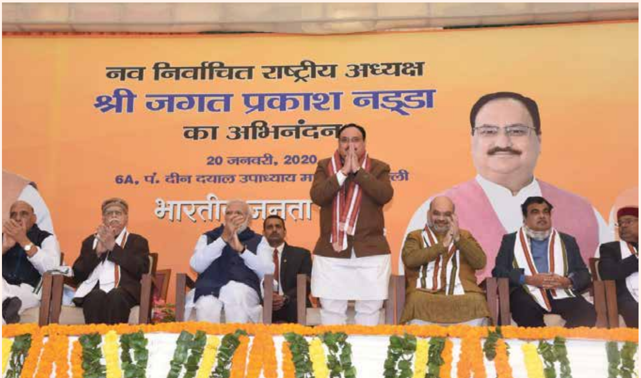
Newly elected BJP President Shri JP Nadda accepting the greetings of Karyakarta's at BJP Headquarters