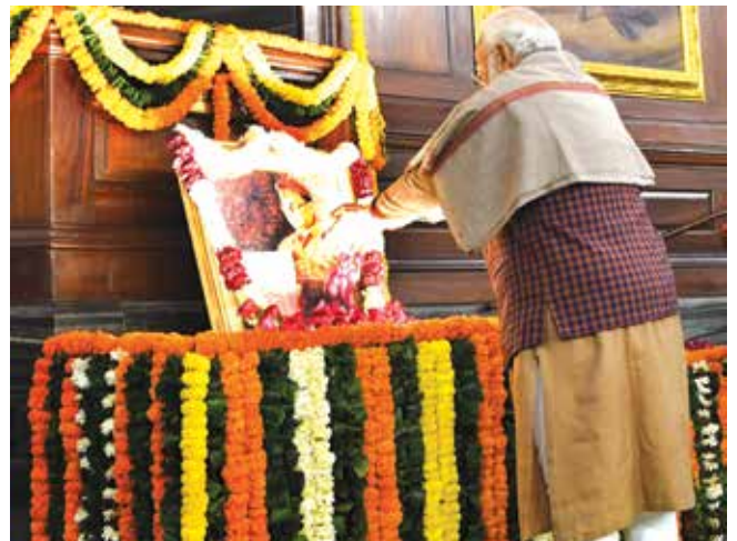
PM Shri Narendra Modi paying floral tributes to Netaji Subhas Chandra Bose on his birth anniversary at Parliament House, New Delhi