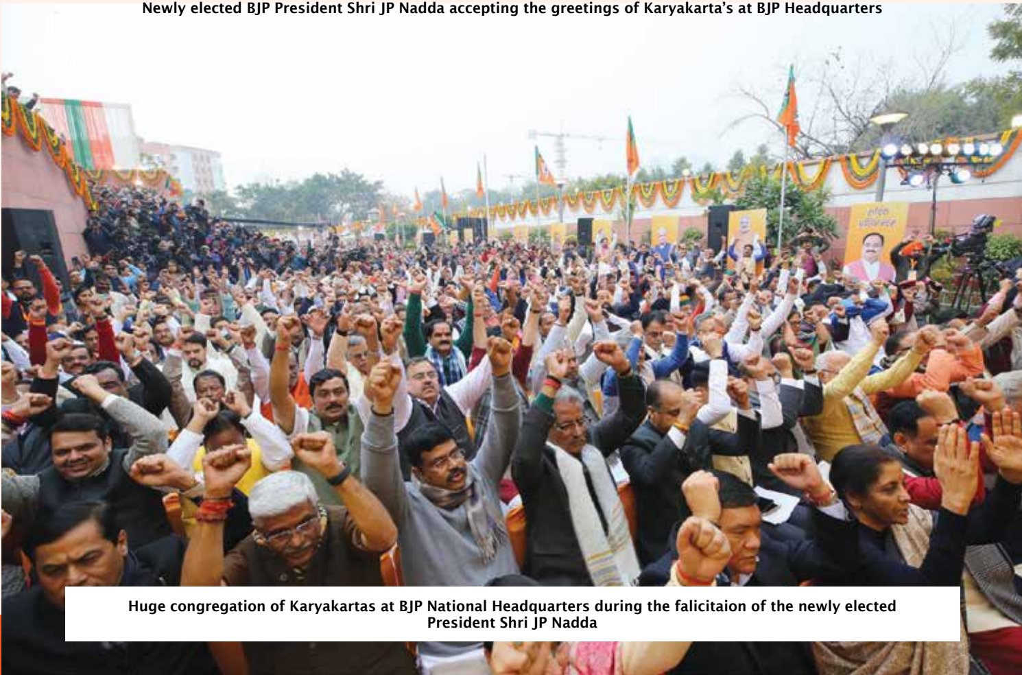
Huge congregation of Karyakartas at BJP National Headquarters during the felicitation of the newly elected President Shri JP Nadda