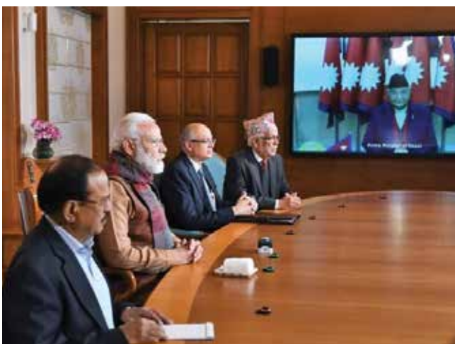
PM Shri Narendra Modi along with PM of Nepal Shri K.P. Sharma Oli jointly inaugurating the second Integrated Check Post (ICP) at Jogbani - Biratnagar