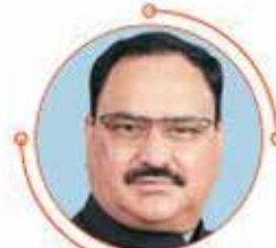
Jagat Prakash Nadda Jan 20, 2020