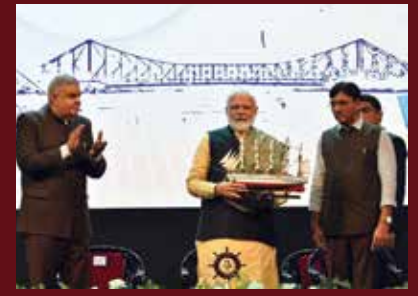
KOLKATA PORT RENAMED AS DR. SHYAMA PRASAD MUKHERJEE PORT...