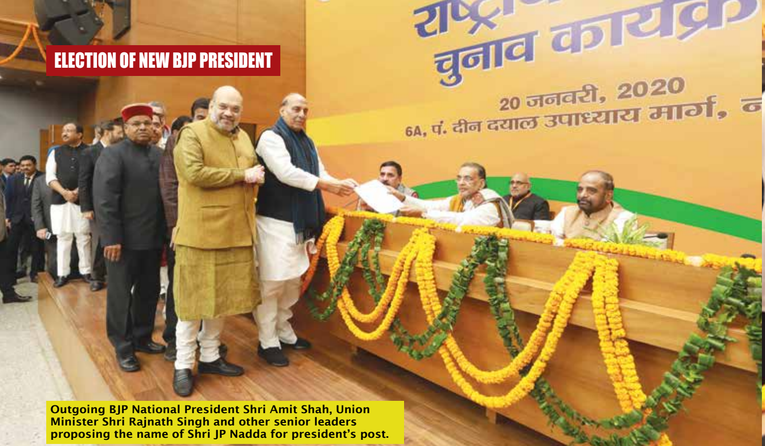
Outgoing BJP National President Shri Amit Shah, Union Minister Shri Rajnath Singh and other senior leaders proposing the name of Shri JP Nadda for president's post.

Prime Minister Shri Narendra Modi also arrived at the party Headquarters in the evening and felicitated the newly elected BJP National President Shri JP Nadda along with the outgoing President and Union Home Minister Shri Amit Shah, former party presidents Shri LK Advani, Dr. Murli Manohar Joshi, Shri Rajnath Singh and Shri Nitin Gadkari, members of the Parliamentary Board, BJP Chief Ministers, National Office