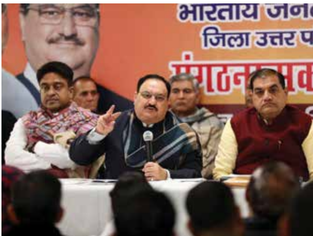
BJP National President Shri JP Nadda addressing an organisational meeting at Narela, New Delhi