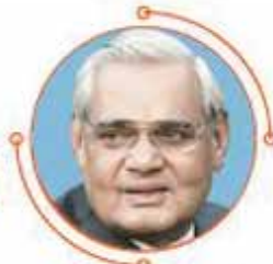
Atal Bihari Vajpayee 1980 to 1986