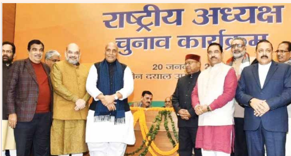
Outgoing BJP National President Shri Amit Shah along with other senior leaders of the party while BJP National working president Shri JP Nadda filing his nomination papers

Shri Nadda faced the arithmetic challenge of the SP-BSP-RLD