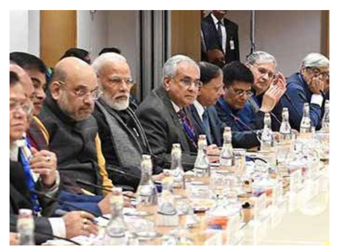
PM Shri Narendra Modi flanked by BJP national president & Home Minister Shri Amit Shah and others meet economists on growth, jobs, $5 trillion economy ahead of Budget in New Delhi