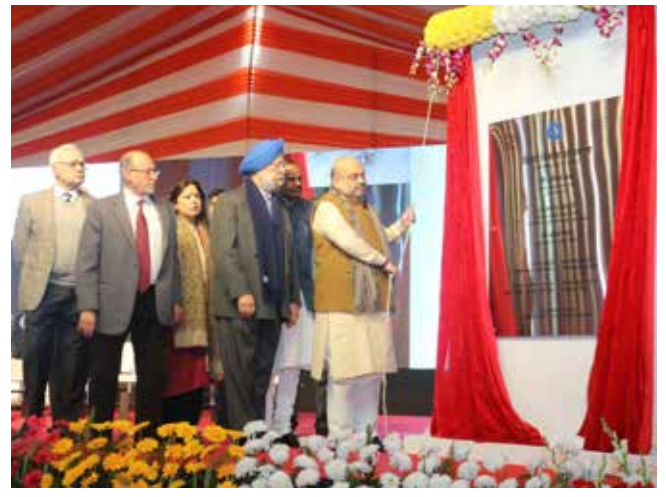
BJP National President & Union Home Minister Shri Amit Shah lays the Foundation Stone of the 'Delhi Cyclewalk' in New Delhi