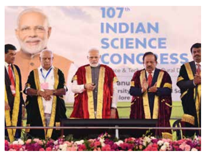
PM Shri Narendra Modi launching I-STEM Portal at the inauguration of the 107th session of Indian Science Congress in Bengaluru