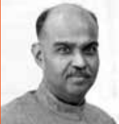
DR. SYAMA PRASAD MOOKERJEE

Dr. Syama Prasad Mookerjee in his presidential address at the first Convention of All India Bharatiya Jana Sangh held in Delhi on 21st October, 1951 elaborated on main reasons behind the formation of Bharatiya Janasangh. We are publishing the full text of his speech for our esteemed readers :