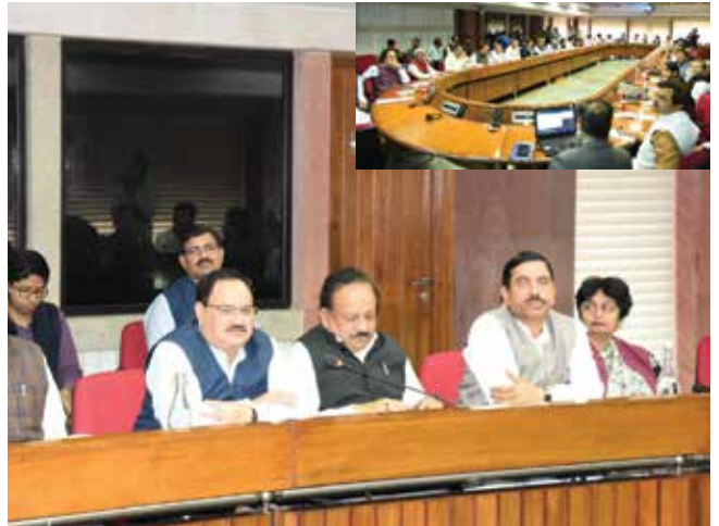
BJP National President Shri JP Nadda attended the meeting of all Doctor MPs on COVID-19 in New Delhi