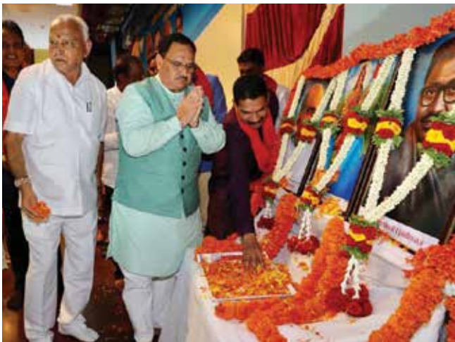
BJP National President Shri JP Nadda flanked by Karnataka CM Shri B.S. Yediyurappa paying floral tributes before the commencement of Intellectuals meet in Bengaluru, Karnataka