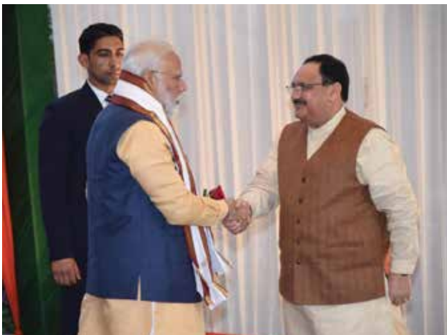
BJP National President Shri JP Nadda welcoming PM Shri Narendra Modi at BJP Head Quarters in New Delhi for Central Election Committee Meeting