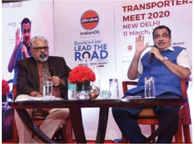
Union Minister Shri Nitin Gadkari addressing the Transporters Meet 2020 in New Delhi