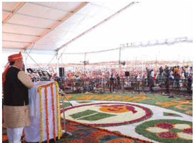
BJP National President Shri JP Nadda addressing a massive Pragati Rally in Sirsa, Haryana