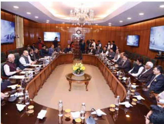
Union Home Minister Shri Amit Shah meeting with a delegation from J&K's newly formed Apni Party led by Shri Altaf Bukhari in New Delhi