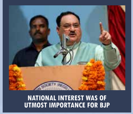
NATIONAL INTEREST WAS OF UTMOST IMPORTANCE FOR BJP