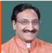
RAMESH POKHRIYAL NISHANK

"Daughters are not a burden but the pride of the whole family. We realise the power of our daughters when we see a woman fighter pilot. The country feels proud whenever our daughters bag gold medals, or for that matter any medal, in the Olympics."