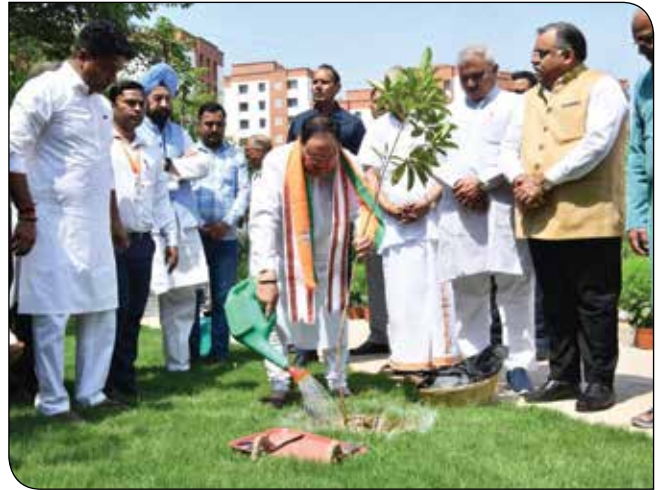
BJP National President Shri JP Nadda planting a sapling on the occasion of World Environment Day at BJP HQ, 6A DDU Marg, New Delhi on 05 June, 2023