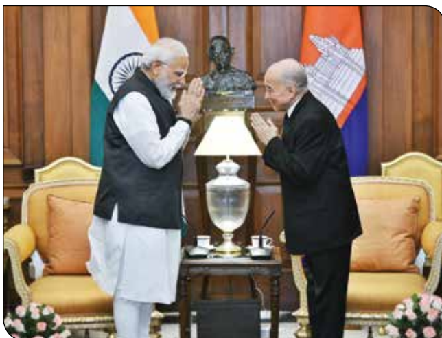
PM Shri Narendra Modi meeting with the King of Cambodia, Mr. Norodom Sihamoni in New Delhi on May 30, 2023