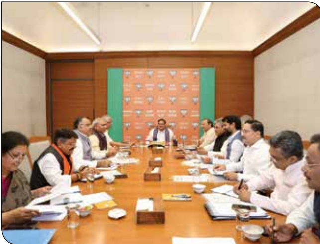
BJP National President Shri JP Nadda presiding over the meeting of BJP National General Secretaries in New Delhi on 09 June, 2023