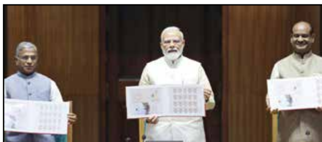
PM Shri Narendra Modi, Speaker Lok Sabha, Shri Om Birla and Deputy Chairman of Rajya Sabha, Shri Harivansh releases a stamp during inauguration ceremony at new Parliament House in New Delhi on May 28, 2023

A special website ( sengol1947.ignca.gov.in ), with details and downloadable videos about the Sengol, was launched by the Home Minister at the event on that day He said, "We want the people of India to see this and learn about this historic event. It is a matter of pride for all." ■