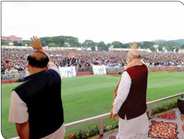
Union Home and Cooperation Minister Shri Amit Shah addressing a massive rally after distributing 44703 appointment letters to successful candidates in Assam on 25 May, 2023