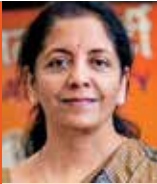
SMT. NIRMALA SITHARAMAN

From new Parliament to GST, digital infrastructure to welfare architecture, in nine years it has moved the nation's story forward.