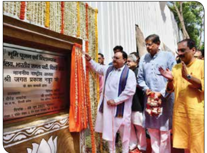
BJP National President Shri JP Nadda while laying foundation stone and doing Bhoomi Pujan of Delhi BJP State Office in New Delhi on 09 June, 2023