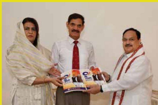
BJP National President Shri J.P. Nadda met Former Army Chief General Shri Dalbir Singh Suhag at 38, Deerwood Nirvana Country, Sec. 50, Gurugram on 5 June, 2023