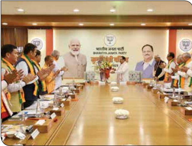
BJP National President Shri JP Nadda welcomes PM Shri Narendra Modi to the BJP Chief Ministers Council Meeting in New Delhi on 28 May, 2023