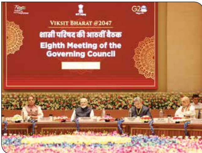
PM Shri Narendra Modi presiding the 8th Governing Council Meeting of NITI Aayog in New Delhi on May 27, 2023