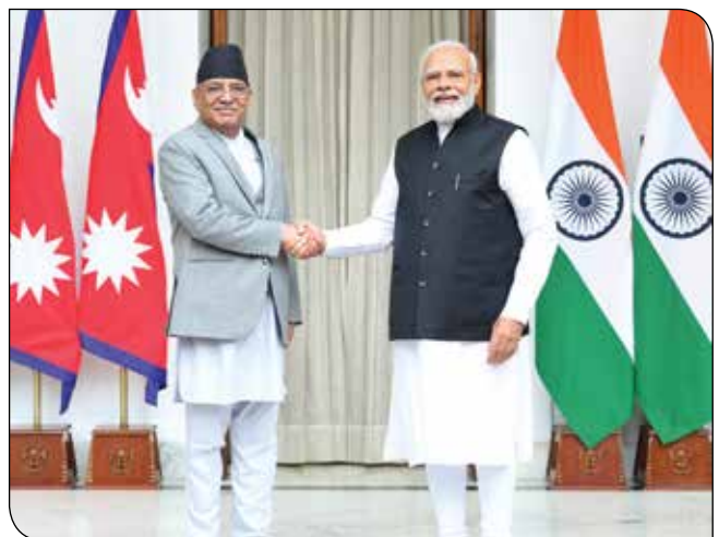
PM Shri Narendra Modi holds a meeting with Prime Minister of Nepal, Shri Pushpa Kamal Dahal at Hyderabad House in New Delhi on June 01, 2023.