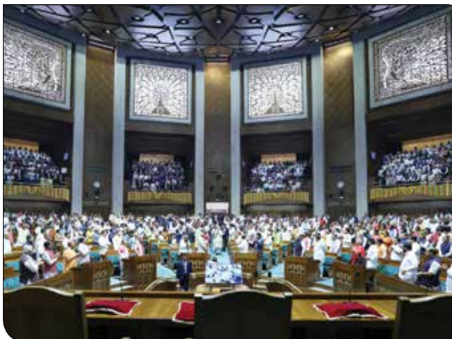
PM Shri Narendra Modi receives warm welcome at the new Parliament House in New Delhi on May 28, 2023