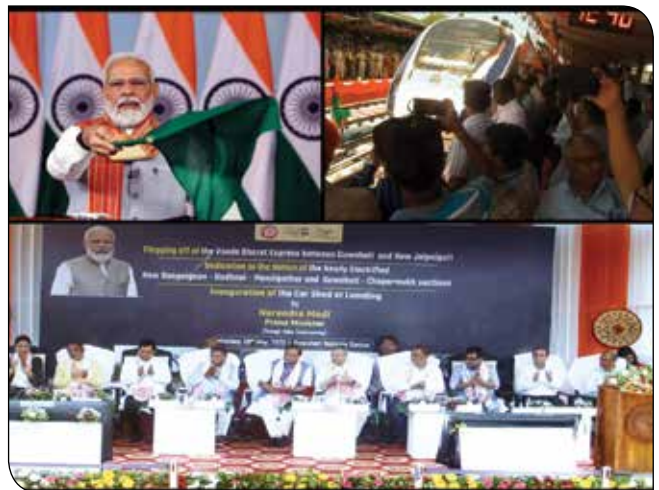
PM Shri Narendra Modi flags off Assam's first Vande Bharat Express train between New Jalpaiguri and Guwahati on May 29, 2023