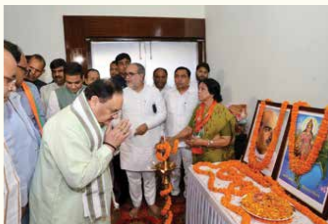
BJP National President Shri J.P. Nadda attending Tiffin Meeting at LPS Global School, D-196/2, Sec. 51, Noida on 07 June 2023