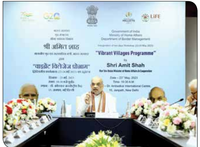
Union Home and Cooperation Minister Shri Amit Shah Inaugurating a two-day workshop on Vibrant Villages Programme in New Delhi on 23 May, 2023