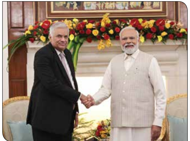
PM Shri Narendra Modi meets with the President of Sri Lanka, Shri Ranil Wickremesinghe in New Delhi on July 21, 2023