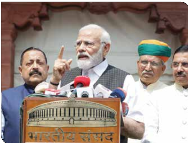
PM Shri Narendra Modi briefing the media ahead of the start of Monsoon Session 2023 of Parliament in New Delhi on July 20, 2023