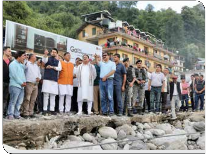
BJP National President Shri JP Nadda and other BJP leaders visiting the flood affected areas in Himachal Pradesh on 14 July, 2023