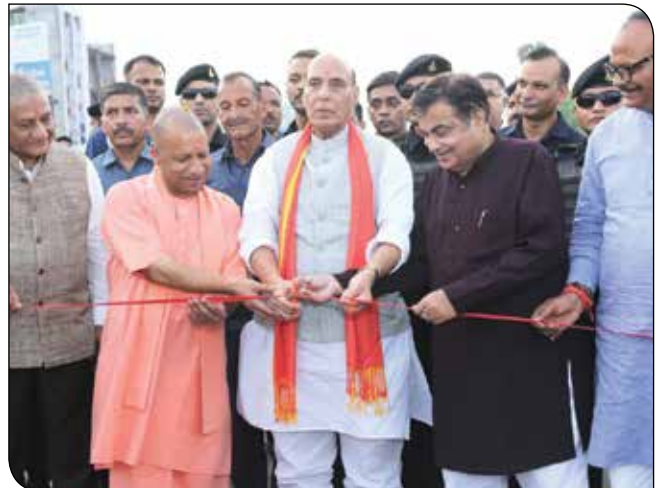
Union Ministers Shri Rajnath Singh, Shri Nitin Gadkari and UP CM Shri Yogi Adityanath inaugurating various development projects in Lucknow, UP on 17 July, 2023