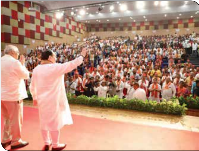
BJP National President Shri JP Nadda along with Gujarat CM Shri Bhupendra Patel receiving the greetings at 'Karyakarta Samwad' programme in Vadodara, Gujarat on 10 July, 2023