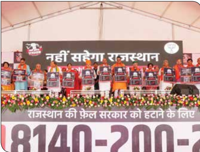
BJP National President Shri JP Nadda while launching 'Nahi Sahega Rajasthan' in Jaipur, Rajasthan on 16 July, 2023