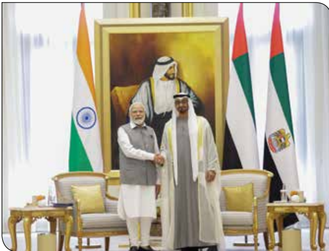
PM Shri Narendra Modi meets with the President of the United Arab Emirates, Sheikh Mohamed bin Zayed Al Nahyan at Qasr Al-Watan (Presidential Palace) in Abu Dhabi, UAE on July 15, 2023