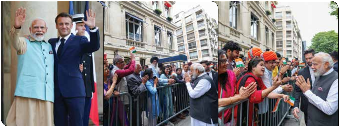
PM Shri Narendra Modi being welcomed by the President of France, Mr. Emmanuel Macron and the Indian community in Paris, France on July 13, 2023