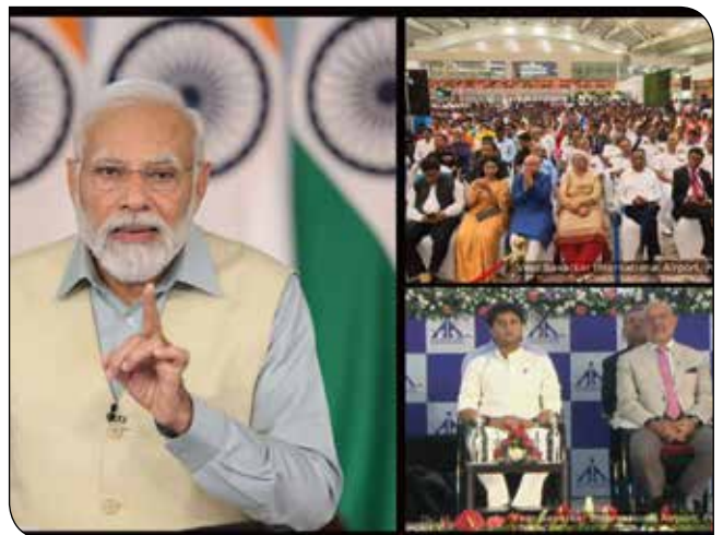
PM Shri Narendra Modi addressing the inauguration of new Integrated Terminal Building of Veer Savarkar International Airport in Port Blair on July 18, 2023.