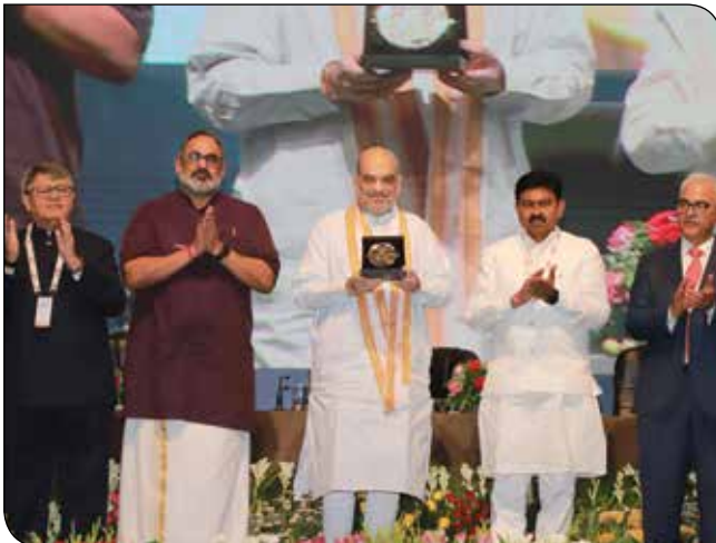
Union Home and Cooperation Minister Shri Amit Shah at the 'G20 Conference on Crime and Security in the Age of NFTs, AI & Metaverse' held in Gurugram on 13 July, 2023