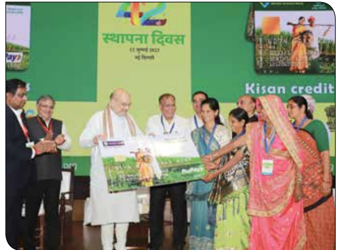
Union Home and Cooperation Minister Shri Amit Shah distributing micro ATMs and 'RuPay Kisan Credit Card' at the 42nd Foundation Day of NABARD in New Delhi on 19 July, 2023