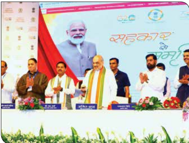
Union Home & Cooperation Minister Shri Amit Shah launching the digital portal to simplify the operations of cooperative societies in Pune on 6 August, 2023