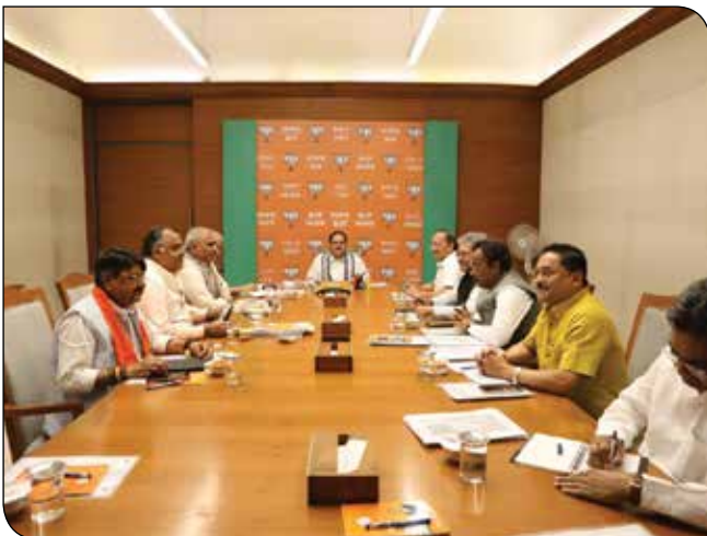
BJP National President Shri JP Nadda chairs the BJP National General Secretaries Meeting at BJP HQ, New Delhi on 28 July, 2023