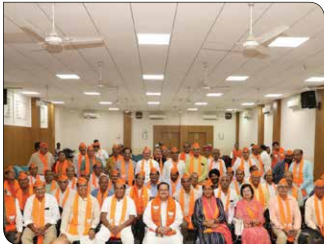
BJP National President Shri JP Nadda interacting with State Senior Karyakartas in Jaipur, Rajasthan on 29 July, 2023