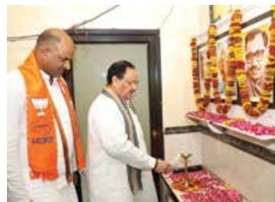
'BJP WILL SWEEP RAJASTHAN ASSEMBLY ELECTION'