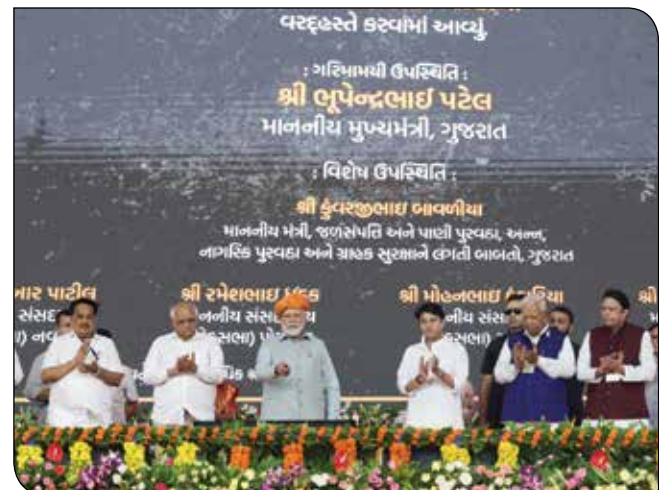
PM Shri Narendra Modi inaugurates multiple development projects at Rajkot in Gujarat on July 27, 2023.