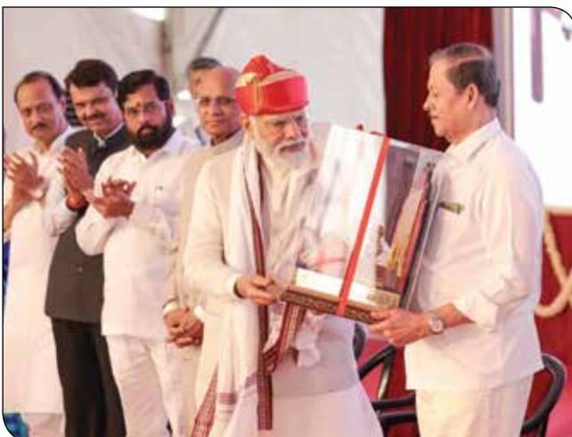
PM Shri Narendra Modi conferred with the Lokmanya Tilak National Award at Pune in Maharashtra on August 01, 2023.