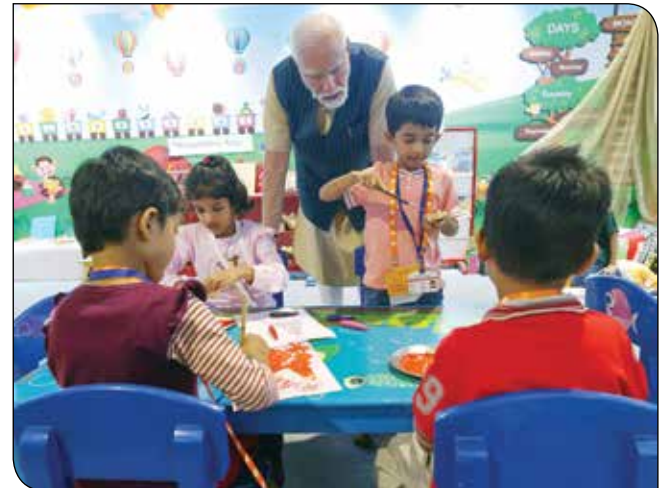
PM Shri Narendra Modi interacting with children at Akhil Bhartiya Shiksha Samagam, Bharat Mandapam in New Delhi on July 29, 2023.