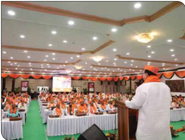
BJP National President Shri JP Nadda addressing the participants in the inaugural session of 'Regional Panchayati Raj Council' held at Surajkund, Haryana on 7 August, 2023