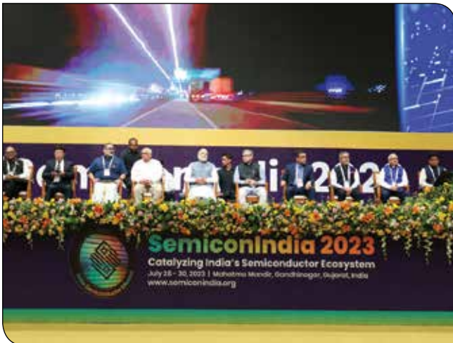
PM Shri Narendra Modi attends the inauguration of Semicon India 2023 at Gandhinagar in Gujarat on July 28, 2023.