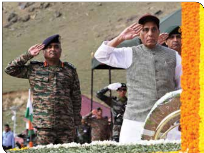
Union Minister Shri Rajnath Singh paying tributes to India's bravehearts on 'Kargil Vijay Diwas' at Kargil War Memorial in Dras on 26 July, 2023