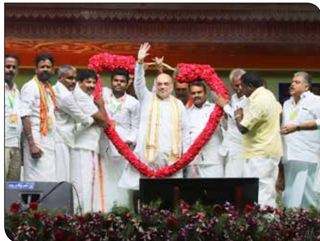
Tamil Nadu BJP welcomes Union Home & Cooperation Minister Shri Amit Shah during the inauguration of "En Mann En Makkal" Yatra in Ramanathapuram on 28 July, 2023