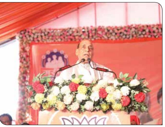
Defence Minister Shri Rajnath Singh addressing a massive 'Jan Ashirwad Yatra' in Neemuch, Madhya Pradesh on 04 Septemebr, 2023