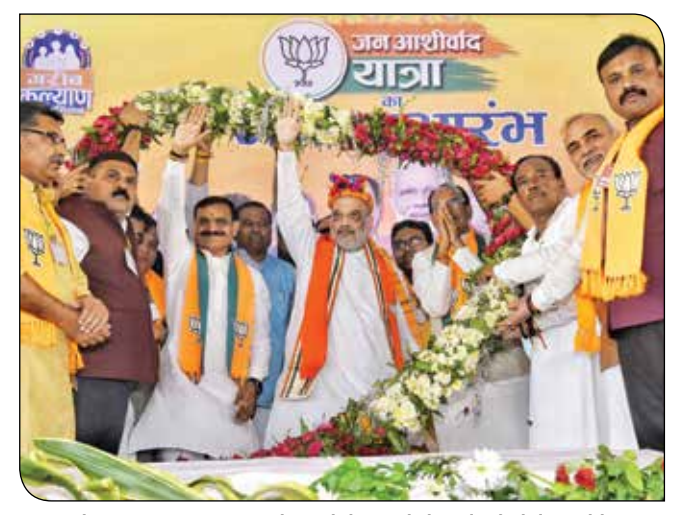
Union Home & Cooperation Minister Shri Amit Shah launching "Jan Ashirwad Yatra" in Mandla, Madhya Pradesh on 05 September, 2023