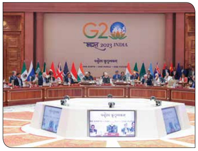
PM Shri Narendra Modi's remarks at G20 Summit on 'One Earth' at Bharat Mandapam, New Delhi on September 09, 2023