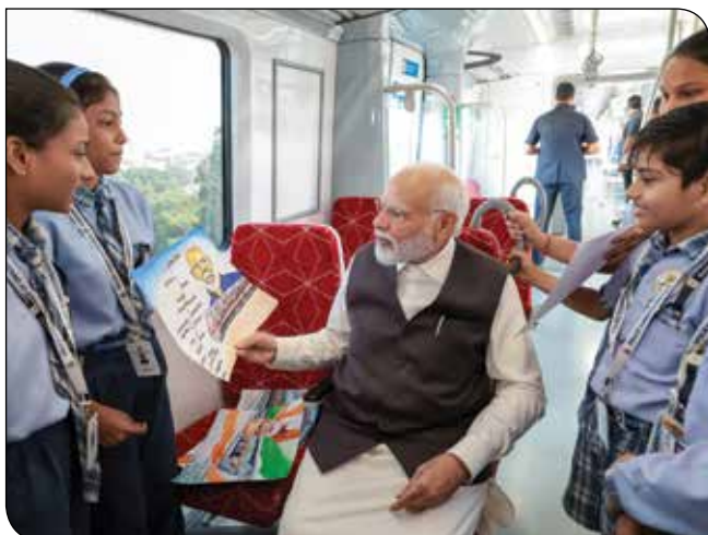
PM Shri Narendra Modi flagging off the RapidX train 'Namo Bharat' between Sahibabad to Duhai Depot in Uttar Pradesh on October 20, 2023. After launching, the PM also interacting with school children and crew of RapidX train onboard.