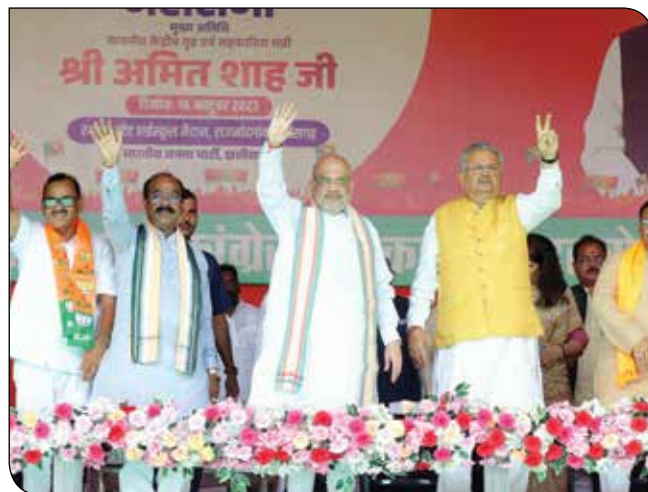
Union Home & Cooperation Minister Shri Amit Shah waving at the gathering at Parivartan Sankalp Mahasabha in Rajnandgaon in Chhattisgarh on 16 October, 2023