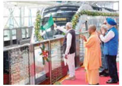
PM FLAGS OFF NAMO BHARAT RAPIDX TRAIN CONNECTING SAHIBABAD TO DUHAI DEPOT