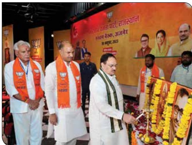
BJP National President Shri Jagat Prakash Nadda at BJP Sambhaag meeting in Ajmer, Rajasthan on 18 October, 2023