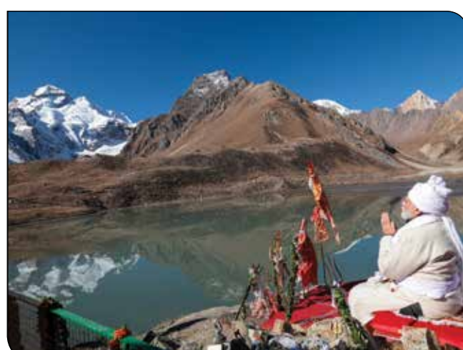
PM Shri Narendra Modi performs pooja and darshan at Parvati Kund at Pithoragarh in Uttarakhand on October 12, 2023