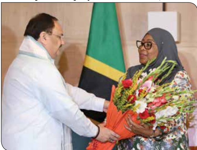
BJP National President Shri Jagat Prakash Nadda meets President of Tanzania Samia Suluhu Hassan in New Delhi on 11 October, 2023