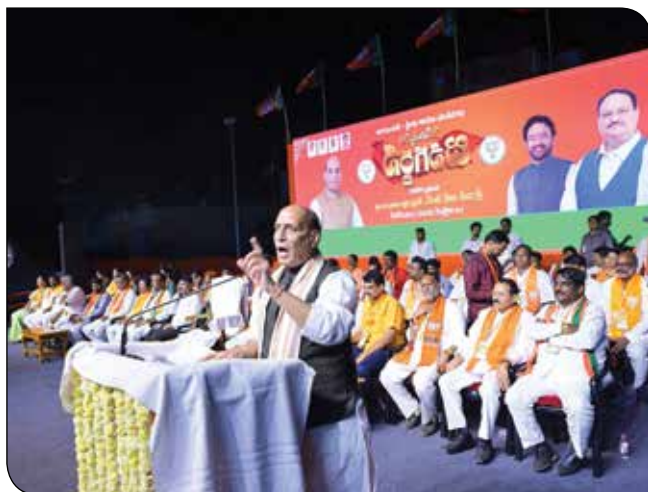
Union Minister Shri Rajnath Singh addressing a huge election meeting in Huzurabad assembly constituencies in Telangana on 16 October, 2023