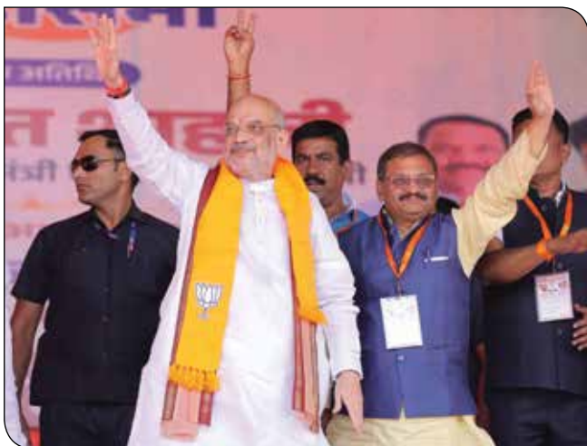
Union Home & Cooperation Minister Shri Amit Shah receiving the greetings at Parivartan Sankalp Mahasabha in Jagdalpur, Chhattisgarh on 19 October, 2023