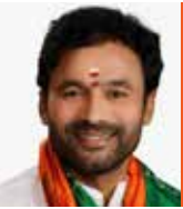
G KISHAN REDDY

Shri Narendra Modi aptly called its passage an Agni Pareeksha for the MPs. An Agni Pareeksha indeed is: an Agni Pareeksha to restore the traditional glory of Bharat, which stood for equality and balance; an Agni Pareeksha to reclaim the highest pedestal that women have enjoyed since time immemorial; and an Agni Pareeksha to rise above political misgivings and stand together for the Naari Shakti.