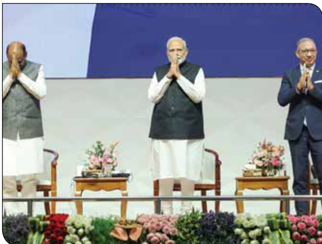
PM Shri Narendra Modi at the inauguration of the 9th G20 Parliamentary Speakers' Summit (P20) at Yashobhoomi in New Delhi on October 13, 2023