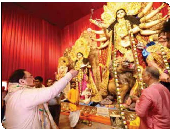
BJP National President Shri JP Nadda visited Puja pandals in Kolkata (West Bengal) & offered prayers on the occasion of Maha Saptami during the Maa Durga Puja Festivals on 21 October, 2023