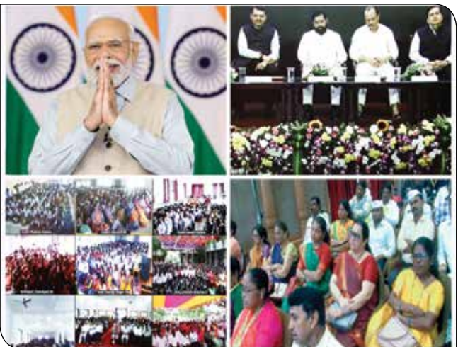
PM Shri Narendra Modi addressing at the launch of 'Pramod Mahajan Grameen Kaushalya Vikas Kendras' in Maharashtra on October 19, 2023