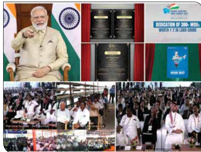
PM Shri Narendra Modi inaugurating the 3rd edition of Global Maritime India Summit (GMIS) 2023 on October 17, 2023